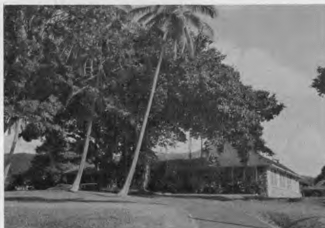
The Manoa property purchased for the Japanese Seventh-day Adventist church of Honolulu.