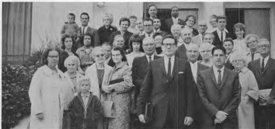
Laymen of the East Oakland church who attended the recent training course.