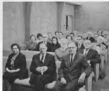
Teachers and students of the Lay Leadership Course held recently in the Hayward church.

Plans are now in the making to involve every member of the Hayward church dur-