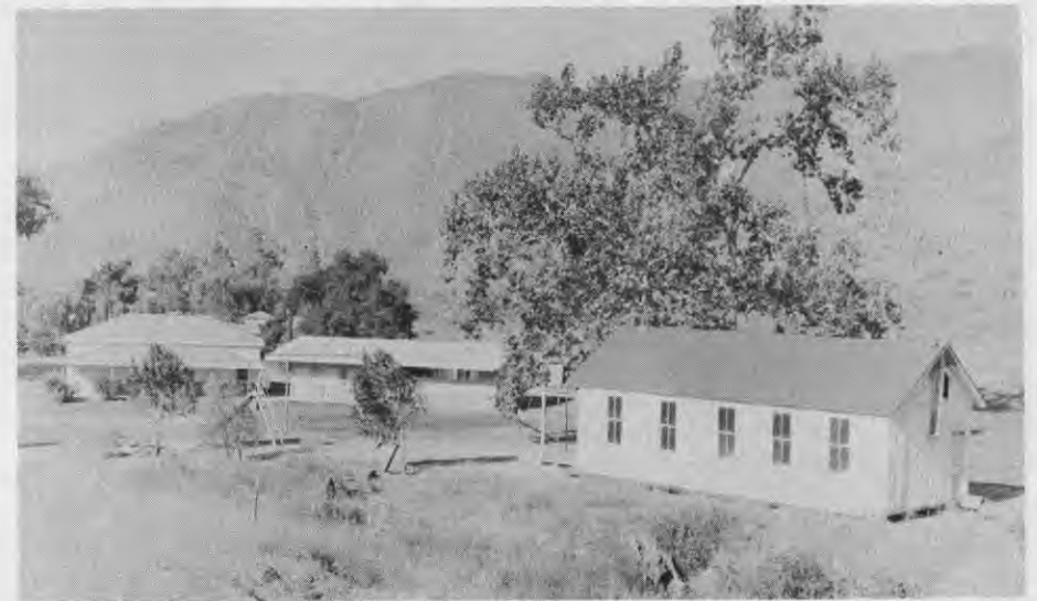
The original building of the San Pasqual church school, right, was built in 1899 and used until 1945. The second building, not shown, was used for the next five years. The third building used for the church school since 1950 is located on the left. On November 7 the latest addition, center, will be dedicated during home-coming ceremonies.

The San Pasqual Church School in the San Pasqual Valley, which stretches about five miles between Escondido and Ramona, California, is the oldest continuously operated church school west of the Mississippi. We are very proud of our heritage and thank God for His blessings upon this school and for the teachers and alumni who have dedicated their services and are giving their lives for the great cause and principles for which this school was founded.