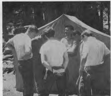
Prayer bands were an important part of the Black Mountain convocation and all youth entered into the prayer groups enthusiastically.