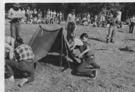
Tent pitching and striking was one of the exciting Sunday morning field events for the Junior Club Camporee.