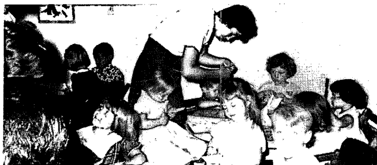
The Kindergarteners of the Middletown vacation Bible school.