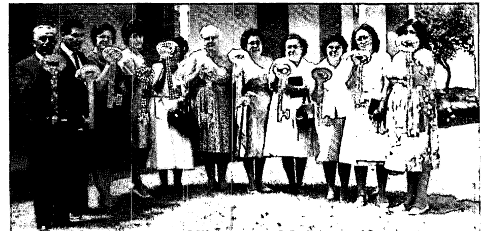
A group of the Brawley Spanish Sabbath school members holding the first quarter's individual Investment goal devices.