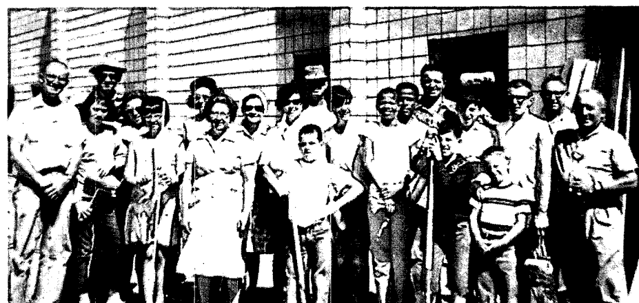
Pictured is a group who turned out for a work bee at the new Las Vegas school.