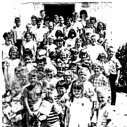
Children who attended the Middletown vacation Bible school pose in front of the church.