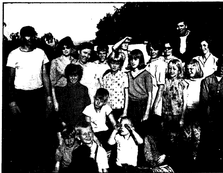
Part of the group who harvested walnuts for the benefit of the Paso Robles Home and School Association at the Dr. Tom Scott orchard.