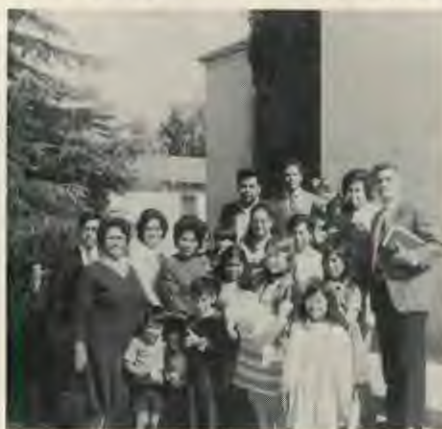
Spanish-speaking group which now meets together in Perris.