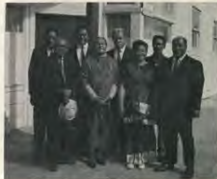
Leaders of the Samoan Branch Sabbath School in San Francisco.