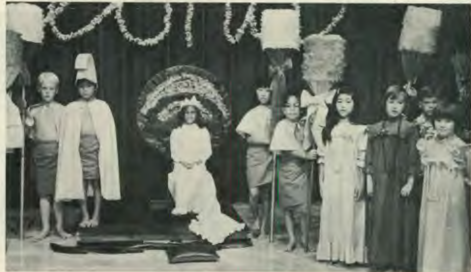
Part of the royal court for the Hawaiian Mission Elementary Aloha Week program.