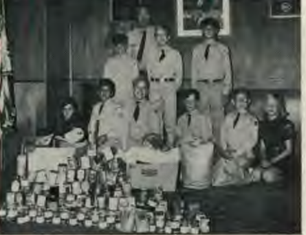
El Cajon Pathfinders pose with the food and clothing they collected Holloween.

POSTMASTER: All returns should be sent to PACIFIC UNION RECORDER, Box 36, Angwin, California 94508.