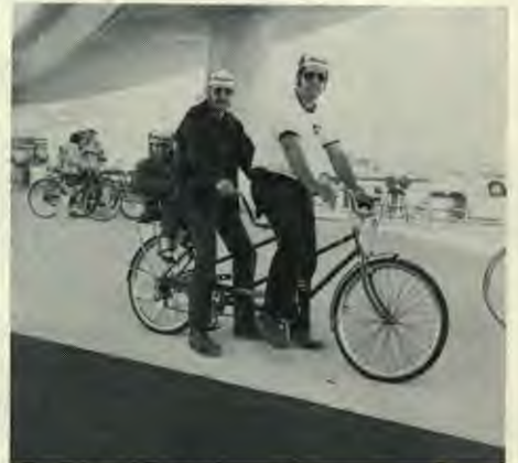
1. Pathfinders register before starting the 50-mile trip. The truck they are purchasing is in the rear. 2. The start of the trip. 3. Unloading at Checkpoint A to start the second lap. 4. There was even a bicycle built for three.