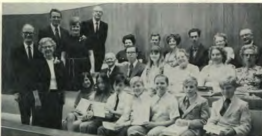
A baptism held in the Calimesa church on March 25 brought the membership to over 400. The pastor and evangelistic team are shown standing behind the candidates.