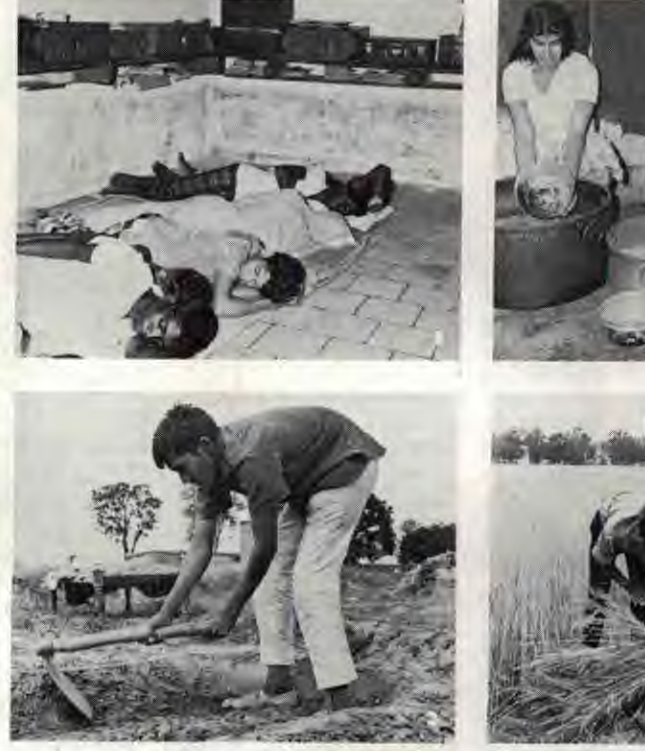
In a dormitory, furniture hardly exists. Work, including washing dishes after meals, is mostly done on the floor. A kundali (hoe) does the work, but it is hard on the back. Harvesting of wheat is done without machines.

Six of the 23 baptized expressed their desire to study in our regular schools, but since we cannot operate regular schools in Burma, they look forward to the time when they can attend the Burma Bible Seminary. Four of these are now attending a government school, and living in our hos-(Continued on page 2)