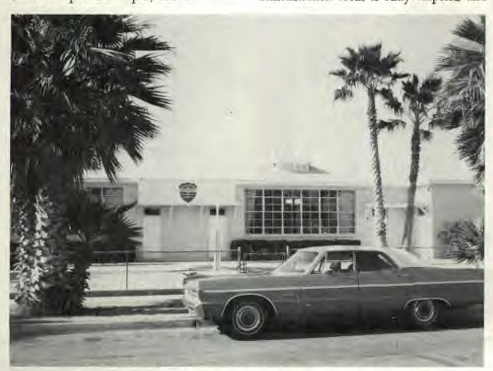
Several Phoenix churches are united at the Valley Community Services Center.

We have four really large rooms and several small rooms at the Center. The demonstration room is fully carpeted and