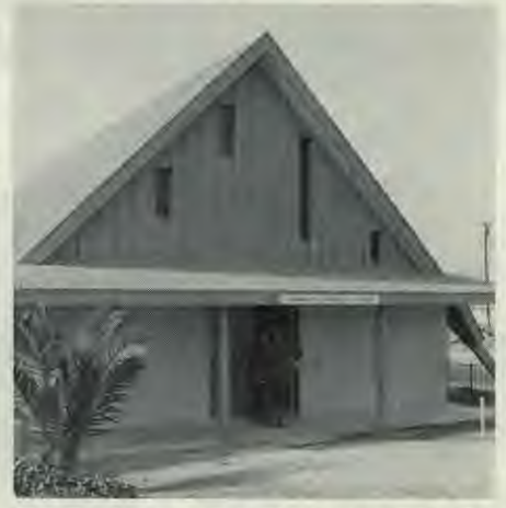
The new Community Service Center in Mentone.

fore the opening. The Open House held all afternoon gave people of the community an opportunity to visit the building and register for the various programs.