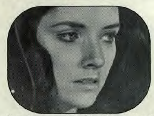
Scenes from the new season's film, "Knock, Knock, Who's There." A gripping account of the modern rebirth of the

Tune in the new Faith and discover a relevant Christianity.