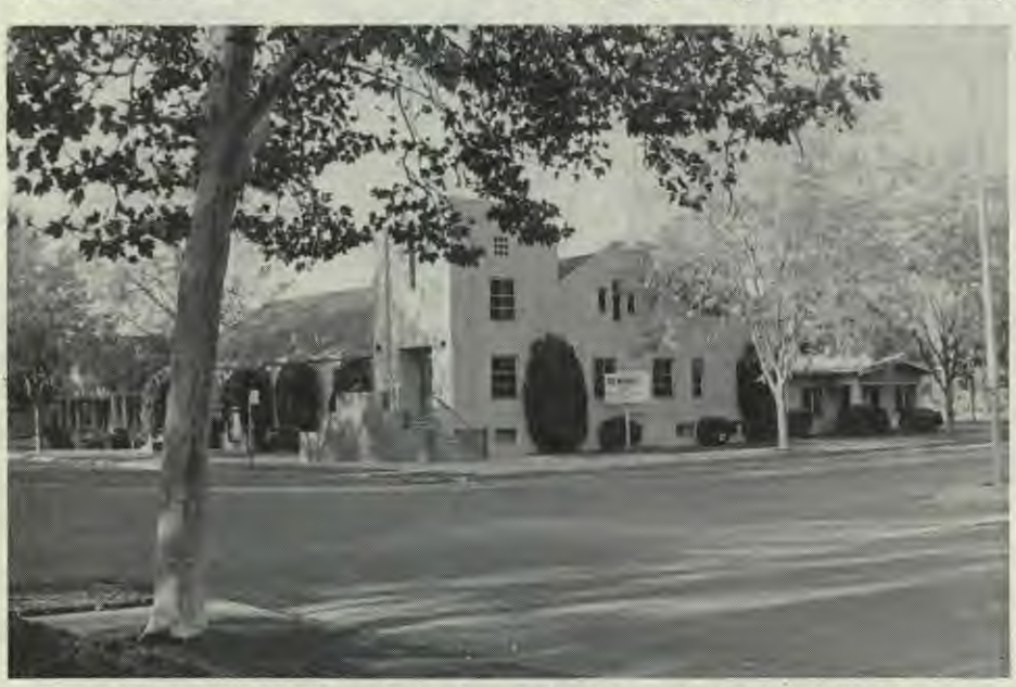
This Methodist Church complex has been purchased by the Modesto Central Church.

Even after the completion of this project the church still had needs; however, since the church is in an area already built up, with property at a premium, it seemed growth might stop. Again God has gone before us, and we have been able to secure the total Methodist Church complex, which includes a parsonage, a 450-seat sanctuary,