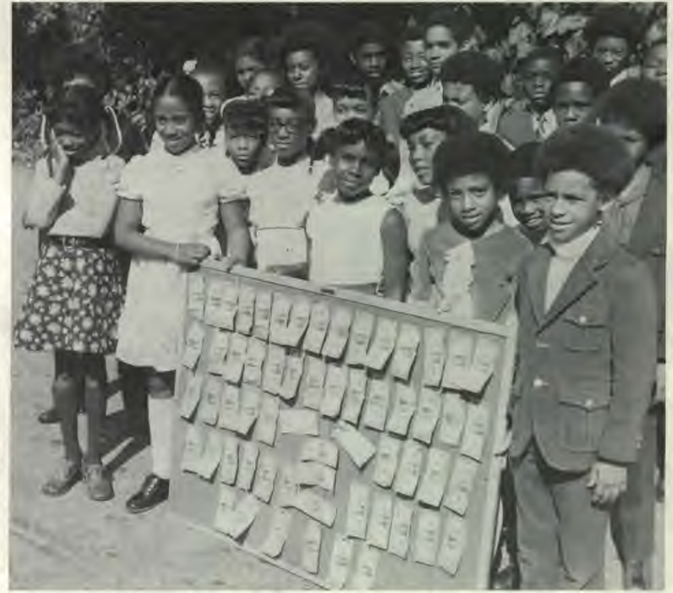
Junior Division members at the Berean Church in Los Angeles plan an extra project every quarter for the 13th Sabbath overflow.

"When the arguments for present truth are presented for the first time, it is difficult to fasten the points upon the mind. And although some may see sufficiently to decide, yet for all this, there is need of going all over the very same ground again, and giving another course of lectures." EV 334