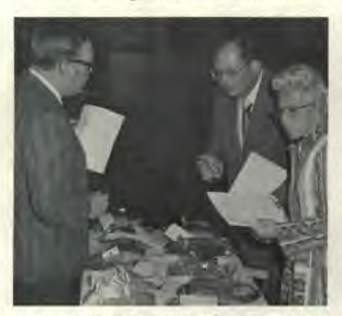
Judges judged the loaves entered on shape, taste

Entries for a Bread Baking Contest at the January Home and School Meeting came from students and parents alike. Appearance, aroma and tastes were enough to tantalize the judges who had to select winners. The prizes-first, $20; second,