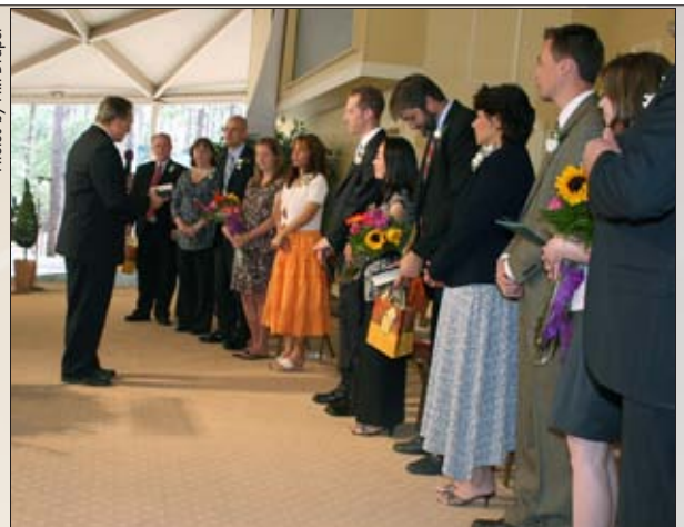
Arizona Conference officers speak to the ordination candidates and their wives.