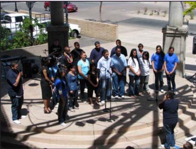
United in Christ sings praises to God.