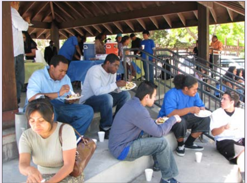
Young people stop for lunch in the park.

embrace God’s love and, above all, to share it with others.