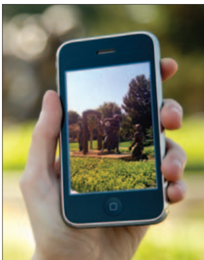
First-year LSU students will receive a free iPhone from the university, made possible by gifts from the university's board of trustees.