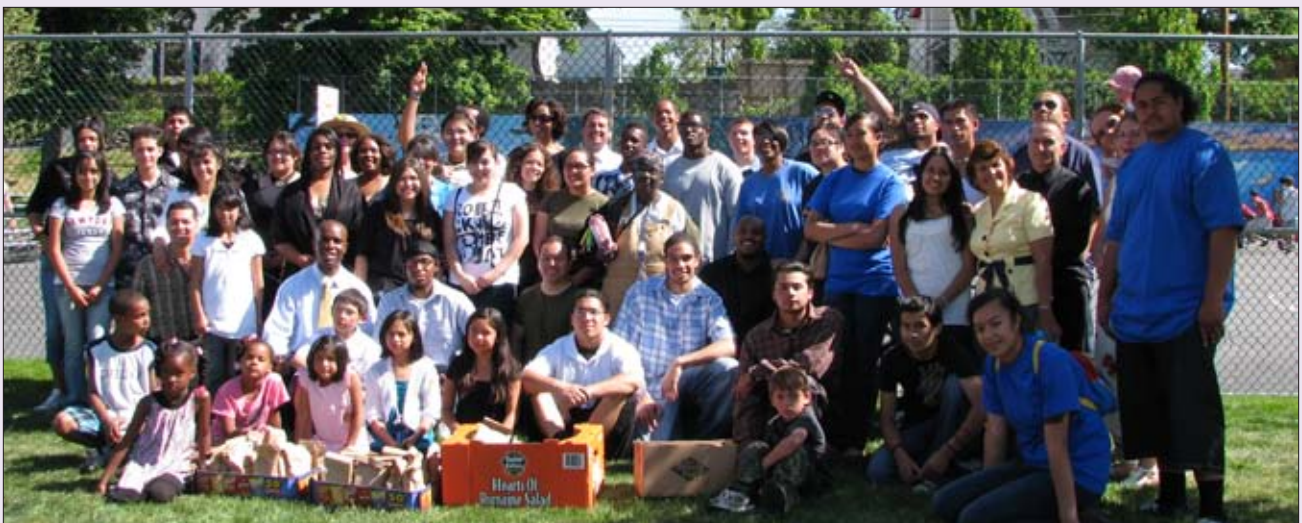
Rally attendees pause mid-day for a photo.