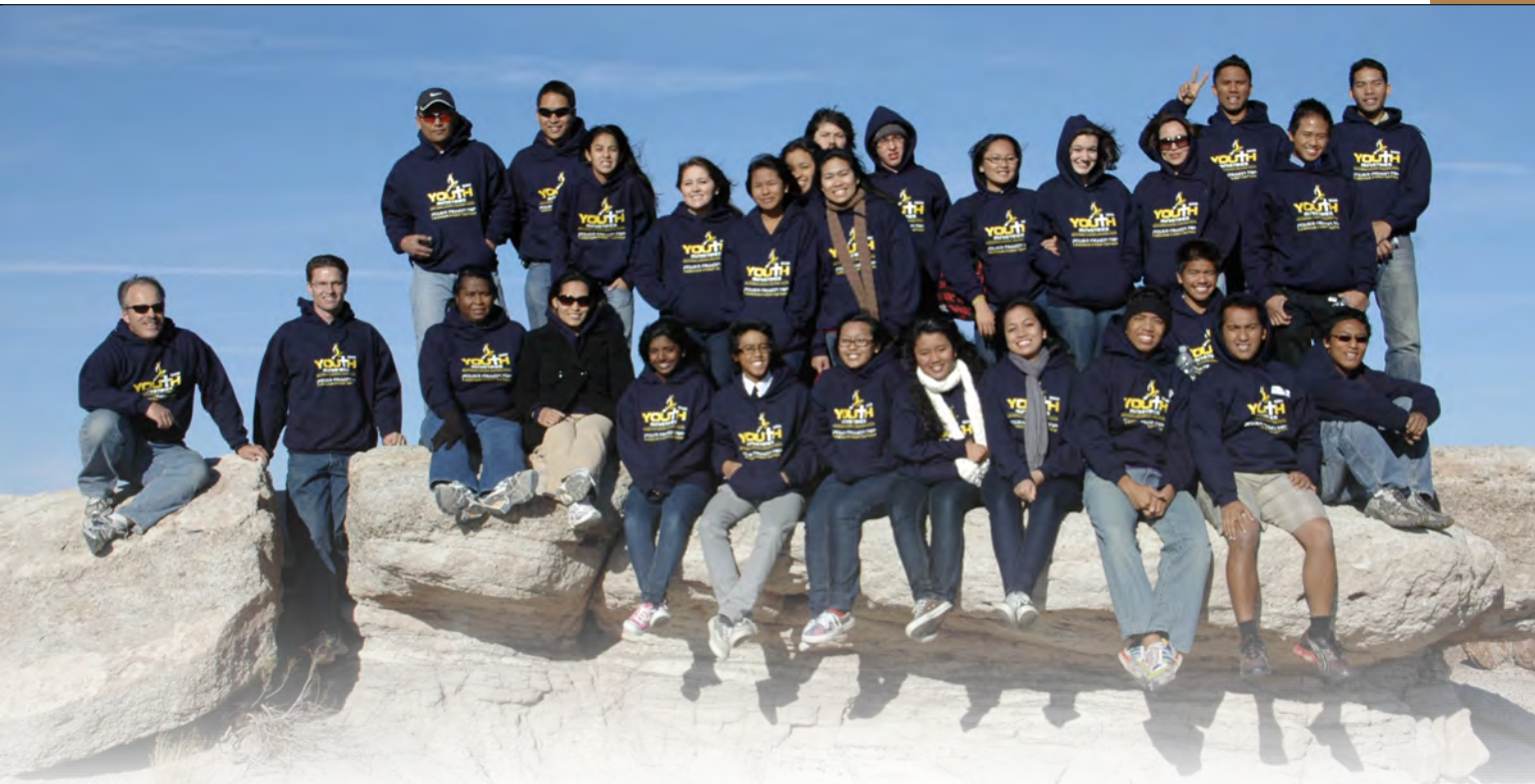
The group that went to Holbrook worshipped in the mission school's church on Sabbath morning, then went hiking in the Petrified Forest National Park.