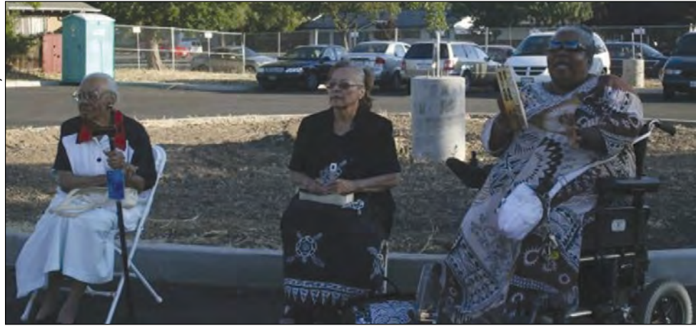
People participate in the tent meetings from the nearby parking lot.