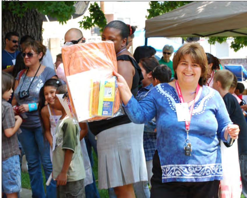
A Burbank resident shows off the free backpack she received at the Fun Family Festival.