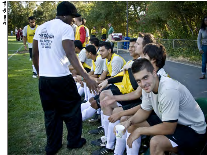
Members of the six varsity teams find that sportsmanship at PUC means more than just doing well on the court or field.