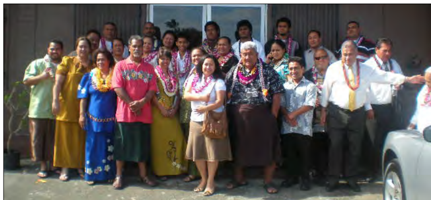
Candidates prepare for baptism.