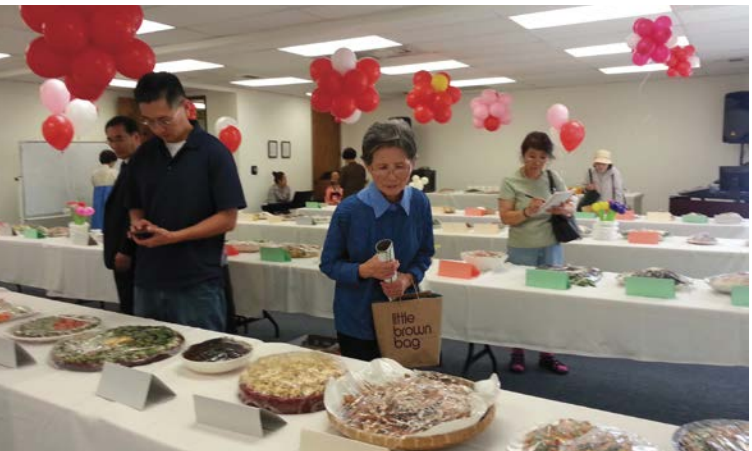
About 70 percent of the festival attendees came from the community to view some 200 plant-based dishes during the afternoon and sample them later at a gala dinner.

PASTOR IL KWON YANG ing class on a local