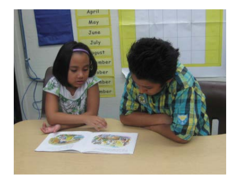
An older boy helps a younger girl with reading.

The student body is composed of only 39 students. This allows for a more intimate setting for students and staff. A typical day in the school includes a school-wide assembly with worship. Each week, one student is featured and celebrated. Older students begin the day with Bible class, while the younger students go to their respective classes. The school serves hot lunch twice a week. Interested students can take music classes and participate in skits and plays.