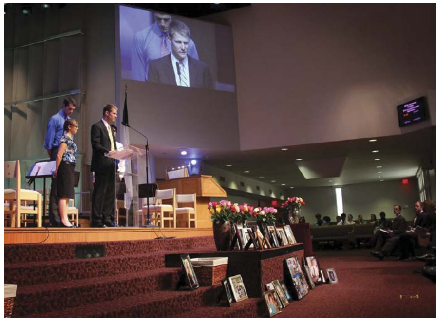
The front of the church sanctuary displays personal photos of those that donated their bodies to the instruction of LLU's students.

whom they had become intimately acquainted as they worked their way through his or her