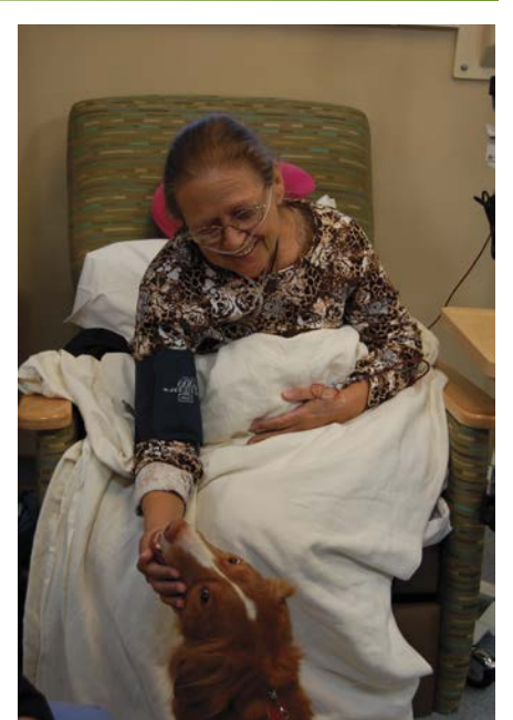
Chili Dog visits a patient at the Feather River Hospital Cancer Center in Paradise, Calif.

At other hospitals, "meet and greet" pet therapy visits may occur throughout the hospital — but patient safety always comes first. Visits exclude areas where the risk of infection is too high, including maternity care, intensive care, the emergency department, burn units, isolation rooms, surgical recovery and others. The pet-han-