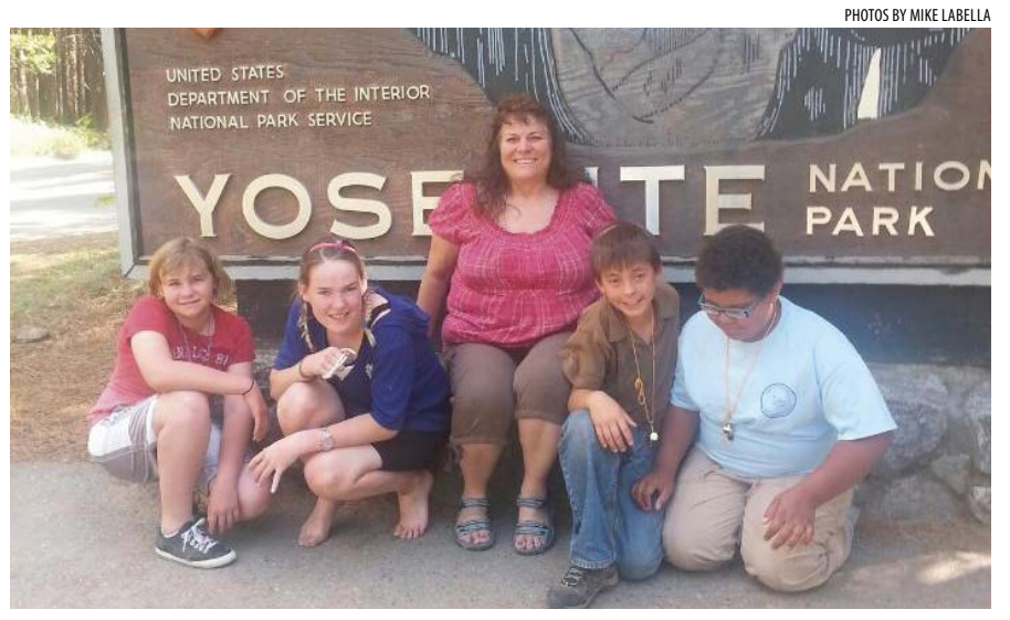
Campers arrive at the park ready to experience God's creation.

Monday, during an open-air tour of the valley, the park ranger shared that there had been a massive rock slide — so large that it had destroyed the switchbacks on the John Muir Trail. Fortunately, because it happened early in the morning, no one was on the trail in the path of the slide. If it had been later in the day, it's possible that many people could have been killed or injured.