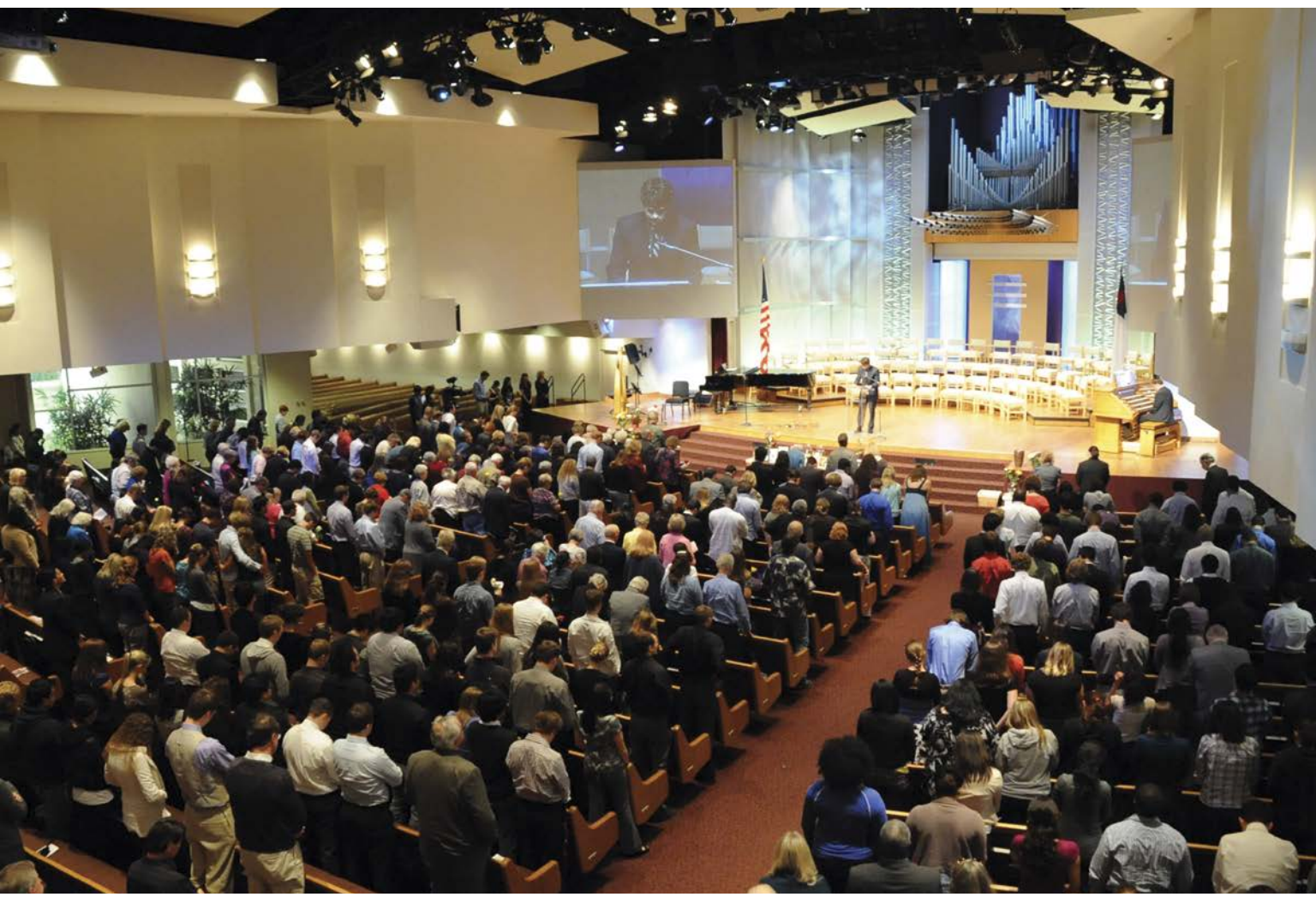
The church was filled with the loved ones of those who had given the ultimate gift.

program when they die. Each year for the past 19 years, some 170 bodies are delivered to our anatomy lab after personal funeral ceremonies, where they are embalmed and used during the school year. When the dissection is completed, the bodies are cremated and the ashes can be returned to the family. This service commemorates a selfless act of giving, with a thank you to those families who participated in the gift.