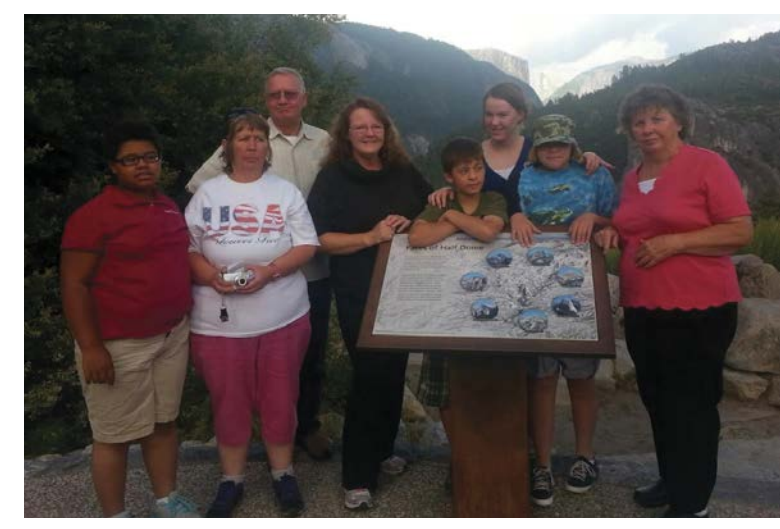
Students and sponsors learn about Half Dome.

"God is great," they all agreed after taking scores of pictures of Bridal Veil Falls, Half Dome, and El Capitan.