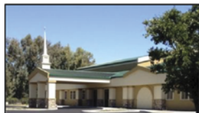
Stockton Mayfair SDA Church