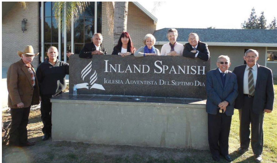
Members of the Inland Spanish church in Colton have been active participants in prison ministry for several years.