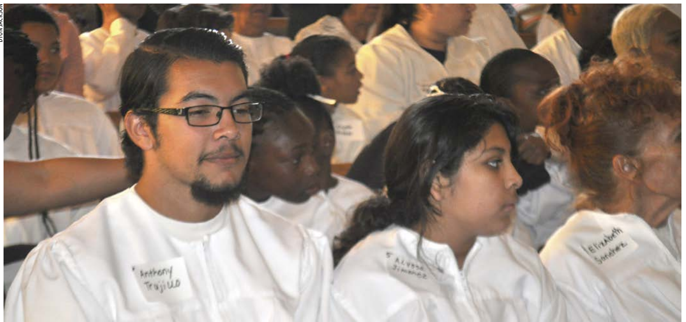
Forty-five people were baptized following an evangelistic series at the Valley Crossroad church in February.