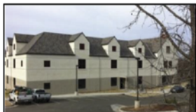
Placerville SDA Multi-Purpose Bldg