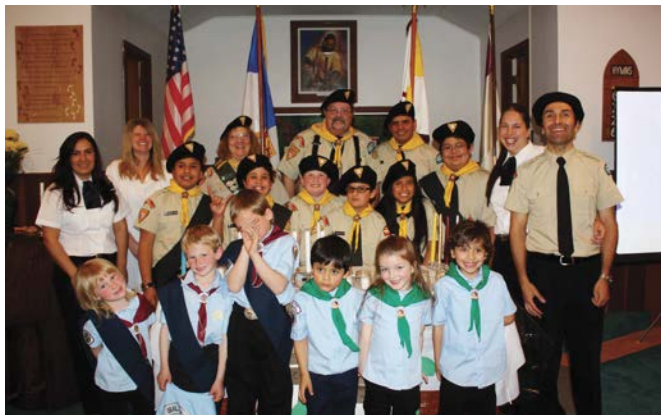
The Elko Pathfinders, Adventurers and Busy Beavers and their leaders were invested March 22.

had never been involved in Pathfinders, and even fewer had experience with Adventurers. Because the church members and parents chose to work together, the program is working.