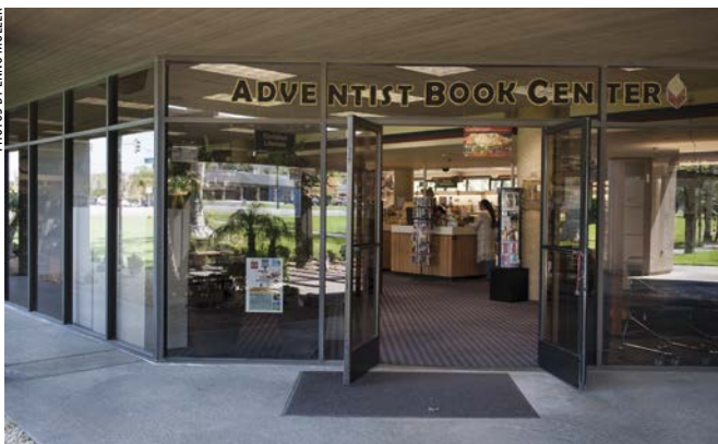
SECC now owns and operates the Riverside ABC.