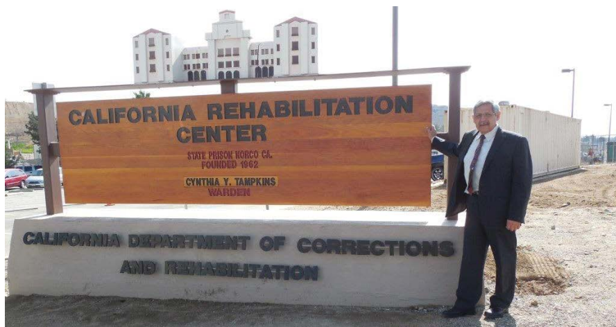
The group of nine volunteers holds two services every Sabbath at the California Rehabilitation Center in Norco.