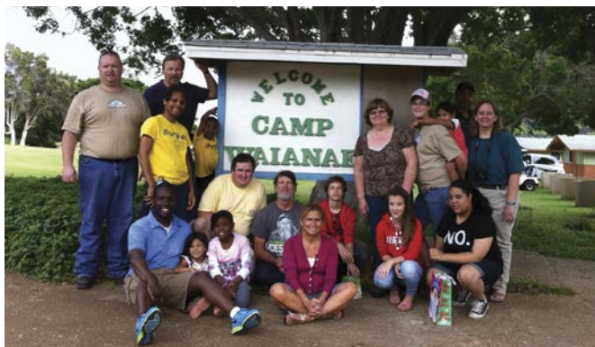
Volunteers from Camp Kalaqua and Florida Pathfinders funded a sound system, a sound booth, and other elements.