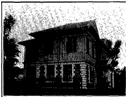
MISSION HOUSE, SINGAPORE

One feature which is very encouraging to us is that the interested ones are quickly doing all they can to get others to have studies from us. "Thou