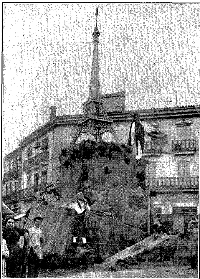
MEMORIAL AGAINST CLERICALISM

With reference to the fifth recommendation, it is well known that interference in political matters in China has been the fruitful source of mischief in this field. The frightful outburst of the