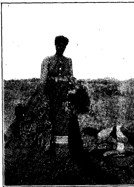
NATIVE MOTHER GATHERING KAFIR PEAS