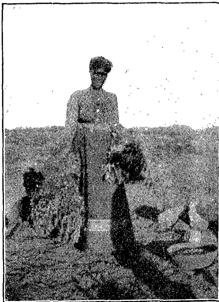
NATIVE MOTHER GATHERING KAFIR PEAS

ended their labors at this mission. So we are still left alone, praying for more help. Nevertheless, the dear Lord has blessed us greatly during the past season. Nine have been baptized and added to the church, and we have another good class to start at once, the members of which will be baptized in due time.