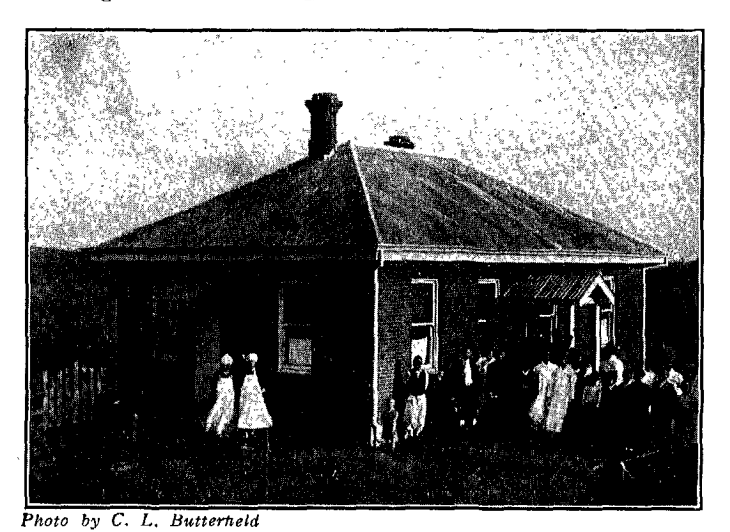
NEW DISPENSARY AT SOONAN

way now seems open for more aggressive missionary work in the neighborhood.