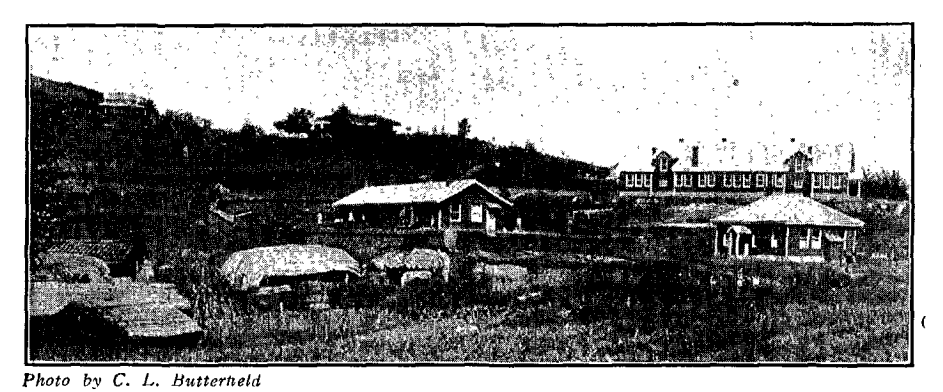
GENERAL VIEW OF BUILDINGS AT SOONAN, KOREA

Forty-nine believers were baptized at the meeting, and a church of fifty members was organized here at our headquarters, known as the Dok Jong Kore church, which is the name of the