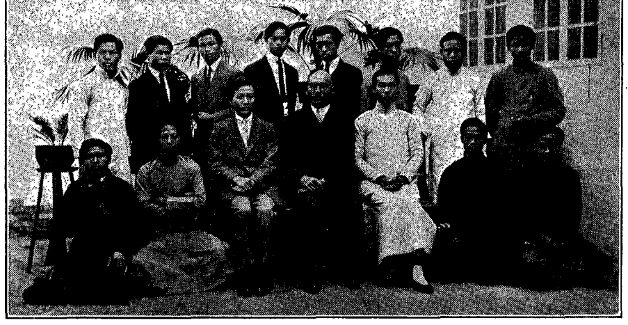
CLASS OF YOUNG MEN IN TRAINING FOR WORKERS IN THE CANTONESE FIELD

PASSING through the rice fields on a recent Sunday, within sight of the mountainous province of Benguet, P. I., I decided once again to contribute to your thirst-quenching columns; for "as cold waters to a thirsty soul, so is good news from a far country."