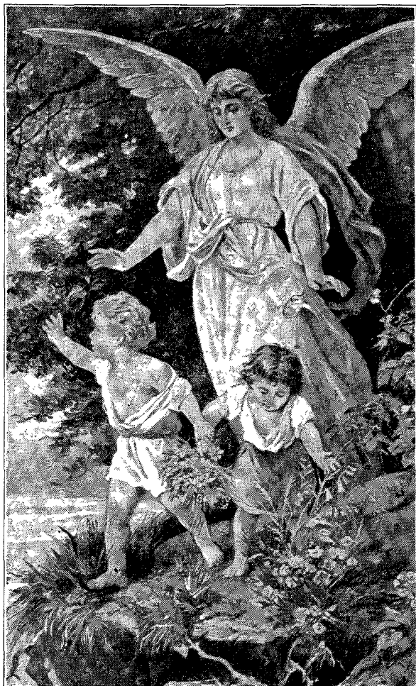
B. PLOCKHORST, ARTIST

One of the signs that we are coming to the end of our journey on earth is that people will be seeking to know more about the Bible. More people will read it. It will no longer be, as this verse says, a "sealed" book. This is