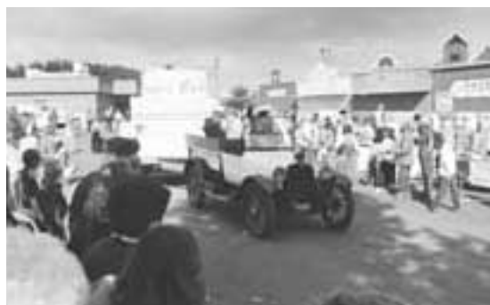
GRAND FINALE: To conclude the birthday-cake parade, dignitaries arrive in antique cars at the main stage near false-fronted buildings on Main Street.