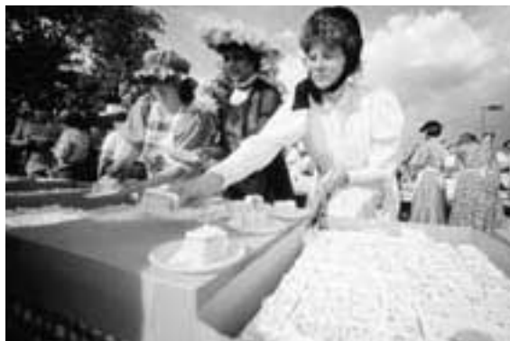
FEEDING 5,000: Costumed employees serve birthday cake to participants at the hospital's celebration.

What hasn't changed throughout the past century is the emphasis on whole-person health care. At the beginning the "Battle Creek treatment philosophy" introduced patients to outdoor exercise, a nutritious diet, hydrotherapy, and other natural reme-