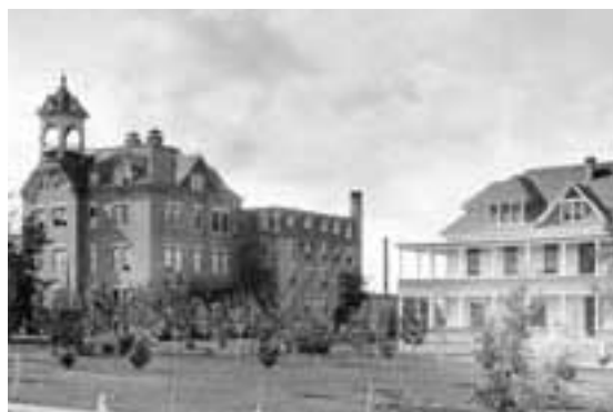
SHARED CAMPUS: From 1907 to 1931 the sanitarium occupied the space on the right of the Walla Walla College Administration building, where the library now stands.

Less than two years after breaking ground on the 23.6-acre campus, the grand opening was held July 10, 1977. The one-level facility was aesthetic and