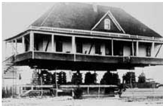
BUILT UP: The old public school building in College Place was purchased in 1906 and moved to the Walla Walla College campus.

As the san prospered, it expanded several times. Space was again cramped when a hospital across town closed its doors. During the Great Depression administrators stepped out in faith and purchased the facility and equipment for a fraction of its value