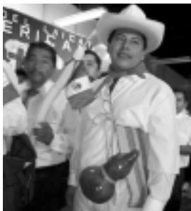
IF YOU'RE HAPPY: Guatemalan lay member, in native dress, celebrates his faith as he and fellow lay members march up onstage.