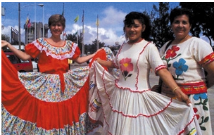
IN VOGUE: Church members from the Mexican Union display their colorful national dress outside the meeting hall in Guatemala City, Guatemala, where laypeople met this past August.

"You can't bring the gospel of salvation to an individual without the Holy Spirit."