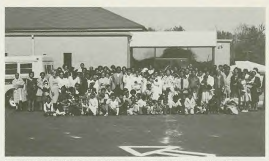
The members of Chattanooga celebrate at the opening of their new church building.

of planning and working, this project became a reality and the members moved into their new church building in October 1979.