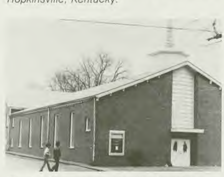
Worship Place at Hopkinsville, Kentucky.