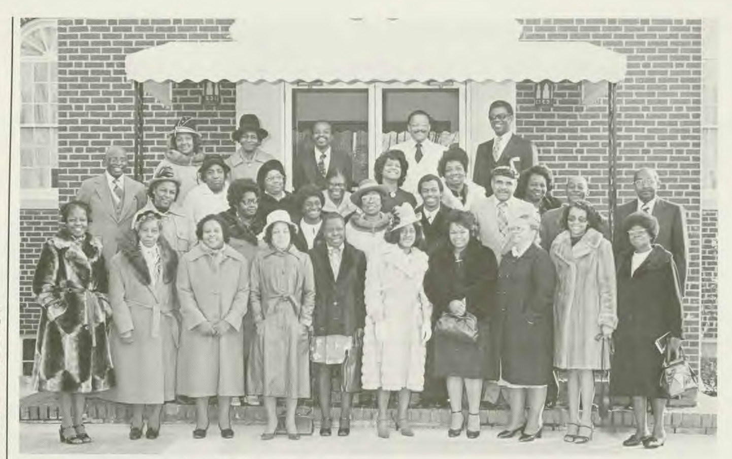
Pictured are 43 centurions who raised $100 or more during Ingathering.