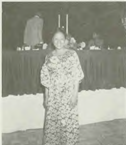
from Oakwood College.