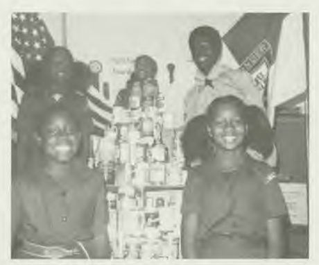
Denver Pathfinder Club

Horseback riding can be tremendous fun. It is also dangerous. The Lord protected nineteen of our Pathfinders as they spent one morning last fall riding horses for pure enjoyment. The evidence of God's watchful care came home to us as we listened to the story of