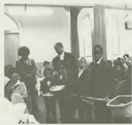
Juniors in training take up offering at Lighthouse Tabernacle in Brooklyn.