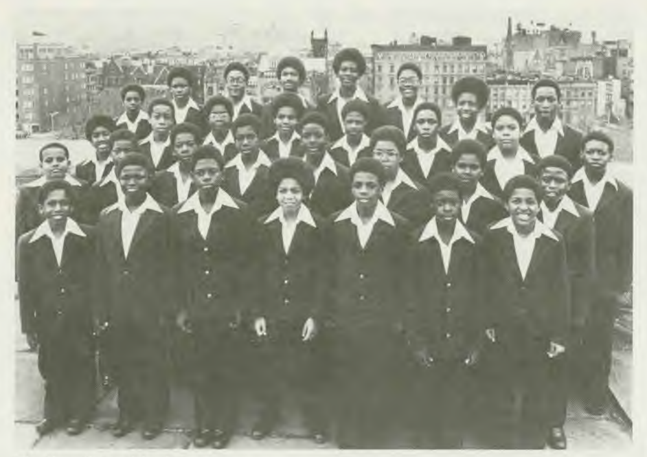
The Boys Choir of Harlem.

black musicians written especially for the BCH. The choir performs numbers in French, Latin, German and an African dialect.