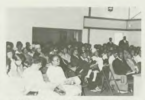
Jackson, Mississippi church opening services audience overwhelming.