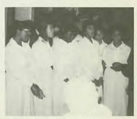
Palace of Peace Choir singing during 11 o'clock service on April 12th.