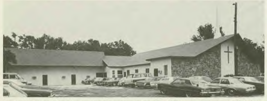
The new Ocala-Shiloh church, which was opened July 12, 1980, cost upwards of $200,000.