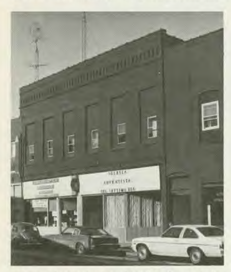
Home of the Aurora Spanish Seventh-day Adventist Church.

members in 1976 has a present membership of 100. The West church's membership stands at 115 and the Aurora church at 43. Both the Aurora and the Northwest churches own their places of worship and the West church is in the process of obtaining a church.