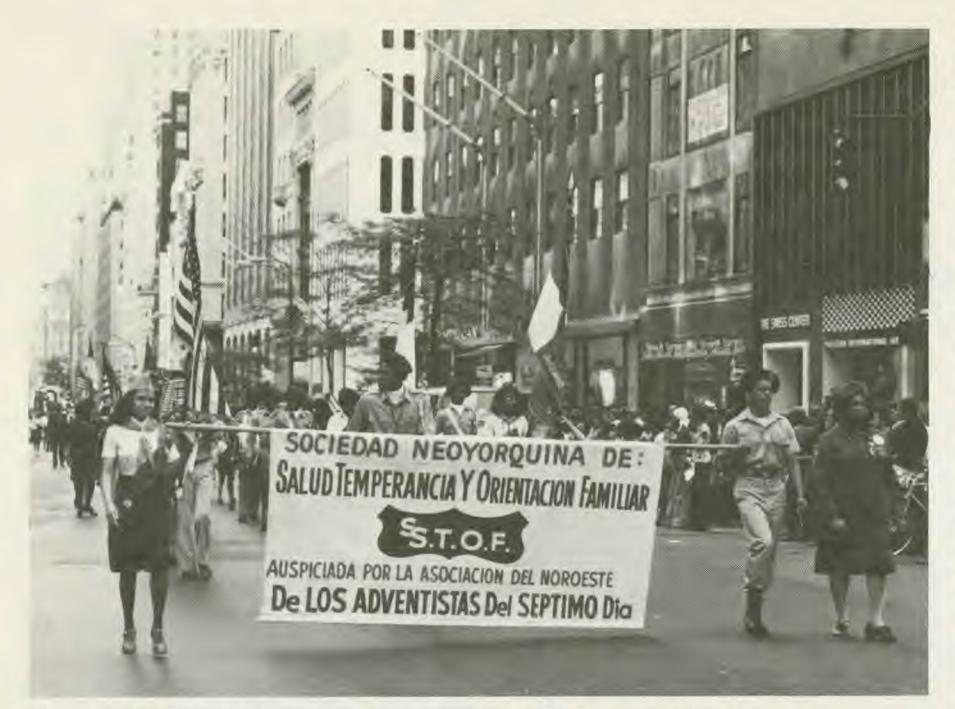
Hispanic Pathfinder club marches in parade down Fifth Avenue in New York City.