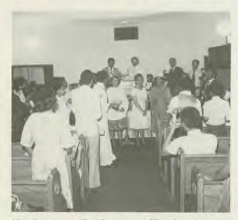
Northeastern Conference officials introducing the new members of the Goshen church.

Since 1963, this congregation has identified itself with the spiritual, physical, educational and economic life of the community through its gospel ministry, its Nursing Corps and sick visitation program, its Community Services Department and more recently through its prison evangelism at the Brooklyn House of Detention. This congregation, under God, was able to purchase a church building, which was recently refurbished and dedicated, in addition to a school building, a parsonage, a multi-purpose building, which houses among other offices the headquarters of Northeastern Conference Book Center, and several lots on South Portland Avenue for the operation of its