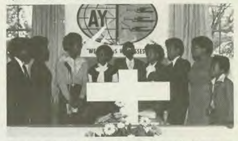
Young people from Shiloh Church, Leavenworth, Kansas, sing for youth Sabbath school.