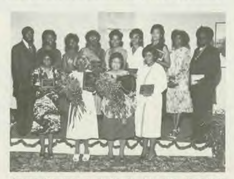
South Central and South Atlantic teachers receive awards for services in teaching.

There are 17 schools in the South Atlantic Conference and 15 schools in the South Central Conference with a combined enrollment of 2,500 students.