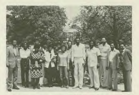
S.D.A. attorneys meet at Oakwood College.

More than 60 black S.D.A. attorney's gathered during alumni weekend at Oakwood College in Huntsville, Alabama, to reaffirm their commitment of helping young men and women who are interested in law. They are now planning to establish a fund to assist these young people.