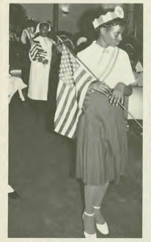
Students from the R. T. Hutson Elementary School in New York participating in a closing school program.

nine cases out of ten, decide their future. The influence of the company they keep, the associations they form, and the principles they adopt, will be carried with them through life."