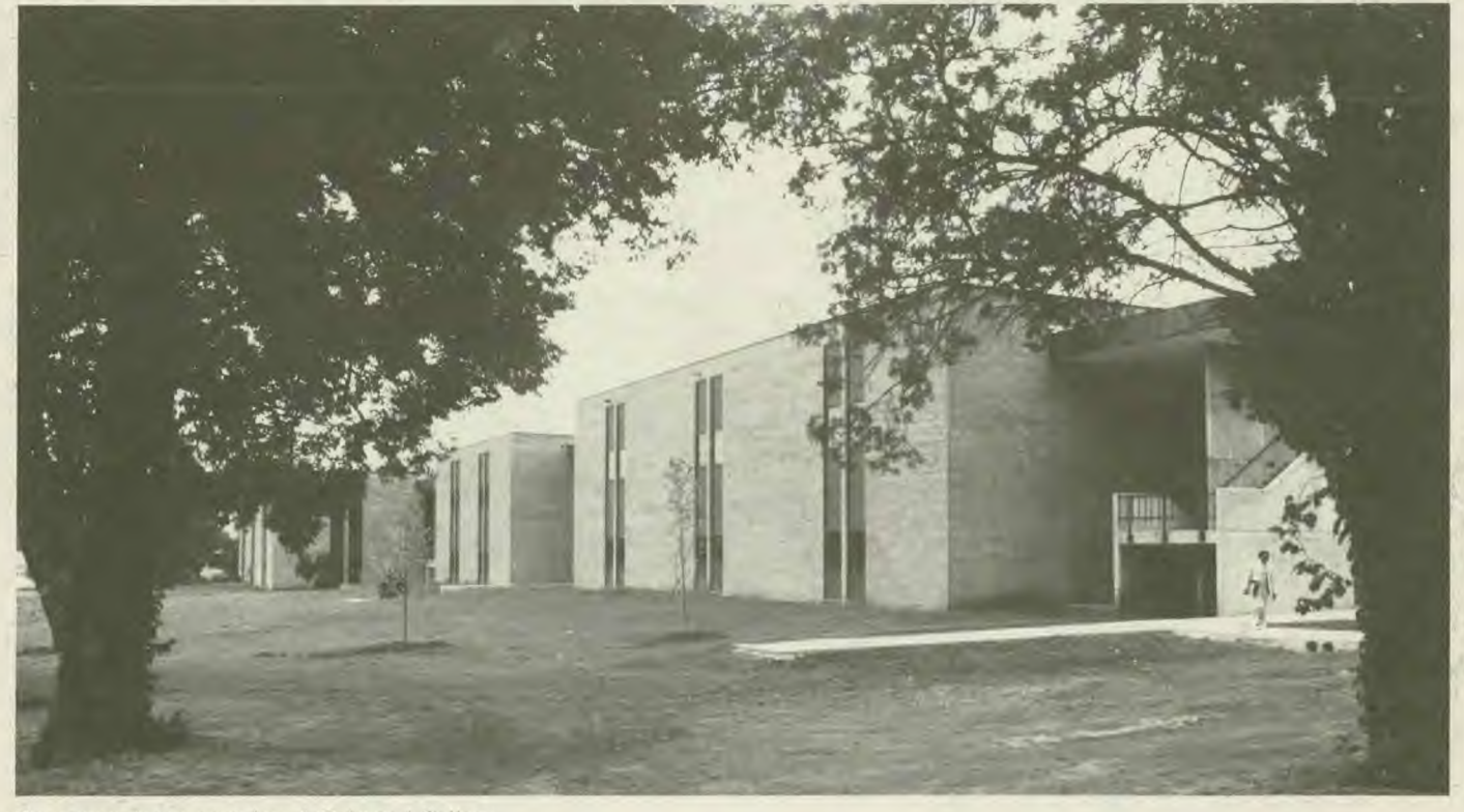
The new science complex at Oakwood College.

"It must be remembered that the youth are forming habits which will, in