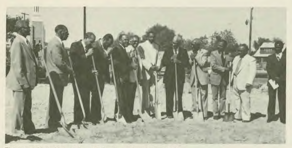
The ground-breaking of Conant Gardens church in Detroit.