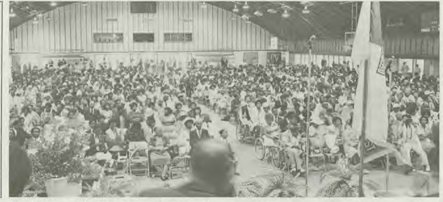
An Allegheny West campmeeting crowd.