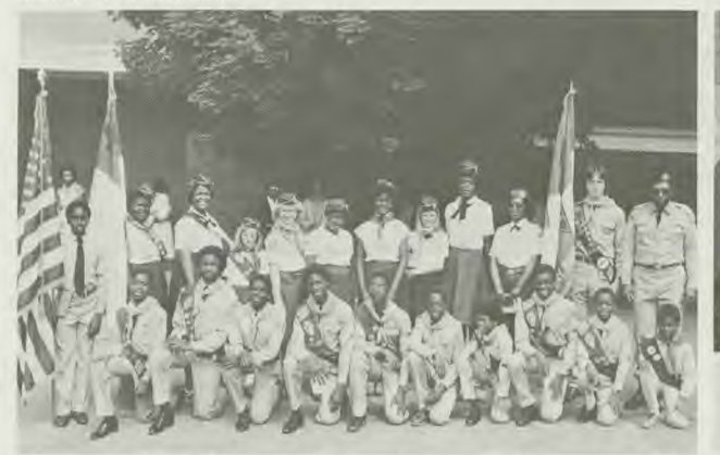
One troop of Pathfinders prepares for review before the Pathfinder Day Parade.