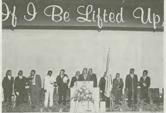
Theme of 1982 campmeeting: "If I Be Lifted Up."