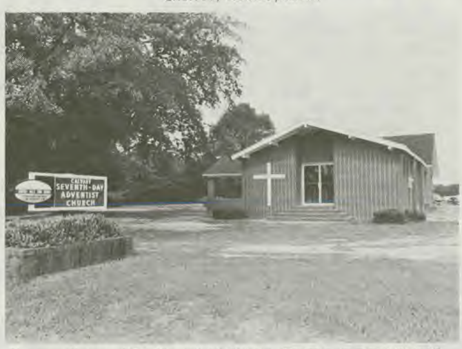
The new Calvary SDA Church of Blakely, Georgia, opened May 15, 1982