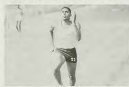
Bridgeton, New Jersey's "Super Flash."