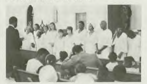
Baptismal candidates being examined.