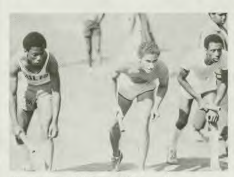
"On your mark! Ready! Set . . . "