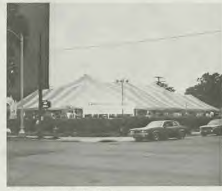
The Canvas Cathedral.

Our first and second baptisms were so large that we could not accommodate them. But the members and pastor of the Ohio Conference church in the area came to the rescue! Like true Christians should, they opened their doors and gave us free use of their ample facilities.