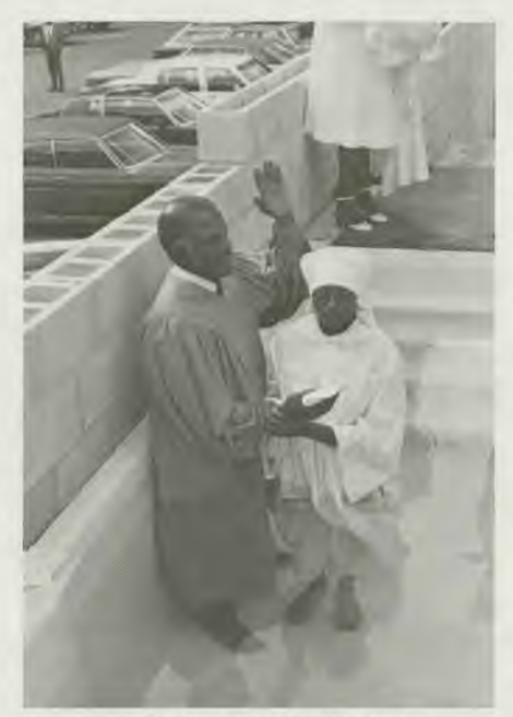
The first baptism at the new Mt. Sinai.