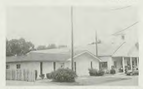
The North Side Seventh-day Adventist Church and educational facility in Pine Bluff, Arkansas.