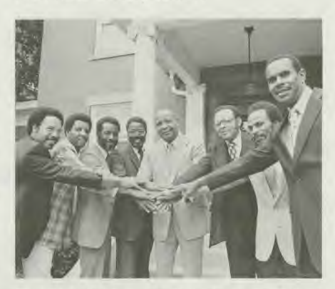
The Cleveland evangelistic team in Columbus.

The members of the three churches in the area really stuck by the meetings. They forsook the comforts of home for eight weeks, six nights per week, to engage in this missionary activity. Laodicean church members who leave their pastors to "walk alone" on the street corners of the cities need to visit Columbus, Ohio. These faithful pastors and laymen have a story to tell!