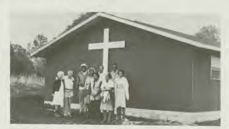
The Triana, Alabama, church building. R. I. Rugless is the pastor.

The Ruprights construct the basic structure of the building and the local congregation is responsible for its completion. Having raised funds for the building with a few donations, Pastor Rugless feels confident that the total structure will be finished during the next few weeks.