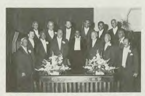
The mortgage-burning ceremony at the Oakwood College church building.