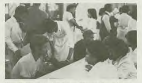
Participants in the Baton Rouge health fair.