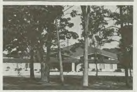
A frontal view of "the church that God built."