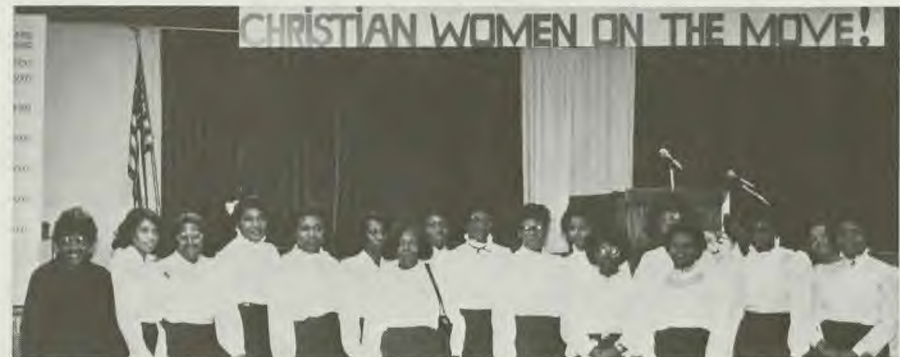
The ladies ensemble that performed during the worship service of the Women's Day program at the Ebenezer church.