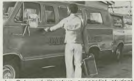
An Oakwood literature evangelist student preparing to drive one of the L.E.T.C. vans.

It is estimated that more than a million people have been contacted through the L.E.T.C. program. There is no way of knowing exactly how many have been saved as a result, but what we do know is that this work is vital and necessary. A current goal of the L.E.T.C. program is to contact 500,000 people during their spring 1984 campaign.