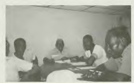
Local elders during a planning session for Earth's Last Warning Crusade.