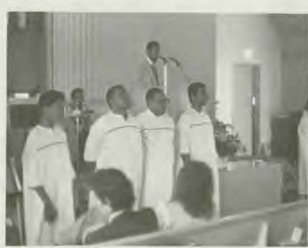
Candidates for baptism.

Many souls have come to Christ through baptism, rebaptism and rededication. Through a series of studies from the book "Preparation for the Final Crisis" during the Wednesday night prayer service, church members were made more aware of the soon coming of our Lord and Savior, Jesus Christ.