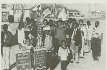
Participants at the winter camp held at Lone Star Camp.