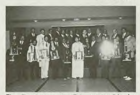
The literature evangelists responsible for $128,692 in deliveries with General Conference and regional conference personnel.