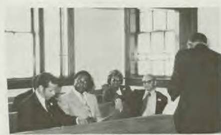
Officers of the East Tennessee small church evangelism rally in a planning session for the next meeting, to be held in Cleveland, Tennessee.

At one of the meetings in Morristown, Tennessee, there was standing room only. This church only has five or six members. The pastor looks for the membership to triple in 1984.