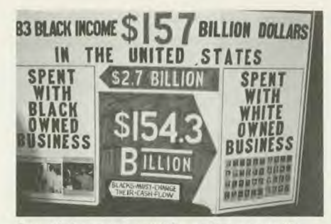
One of the many exhibits at the assembly.

Other discussions and workshops dealt with economics, family life, politics, employment and education. This was the first of such meetings that are to be held among black religious leaders.