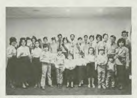
Members of the Central Spanish Pathfinders Club.