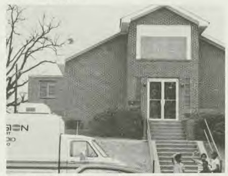
The Philadelphia church in Shreveport, Louisiana.

The ministers and churches cooperated beautifully for this large harvest of souls. We rejoice over the outpouring of the Holy Spirit.