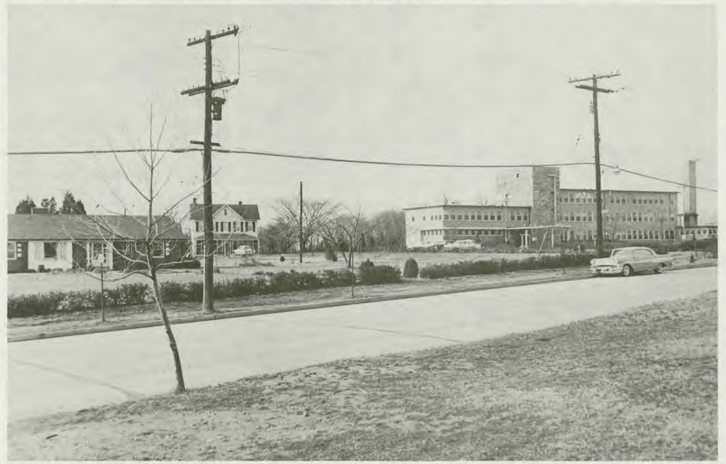
Hadley Memorial Hospital, The Hadley Home and the Hadley Administrator's white two-story home — early 1960's.