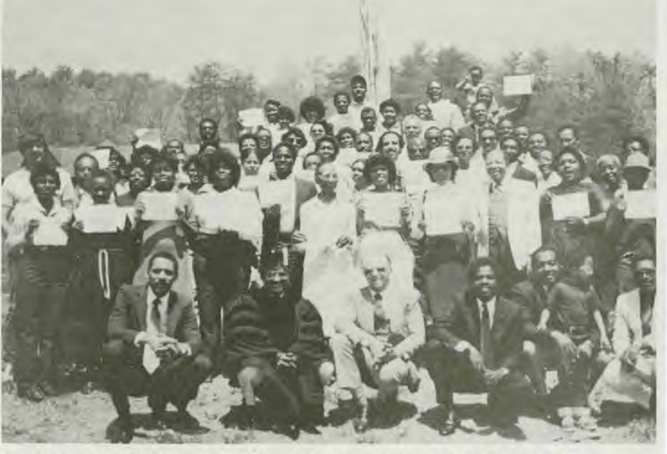
wood College. Although he did not receive Graduates of the LE Training School. The Instructors, are kneeling on the first row.