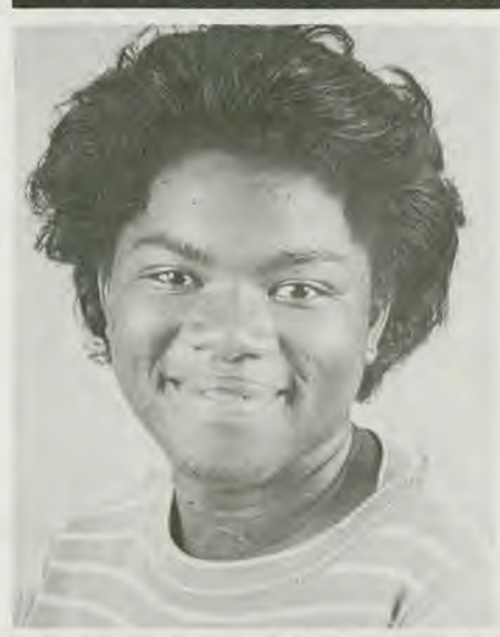
all around excellence at the Youth Award Banquet.