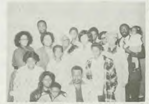
INFILTRATION EVANGELISM REACHES BRENT, ALABAMA

After five years, the membership stands at 350, it has nearly outgrown its new facility.