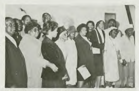
Columbus, Mississippi, mortgage burning.