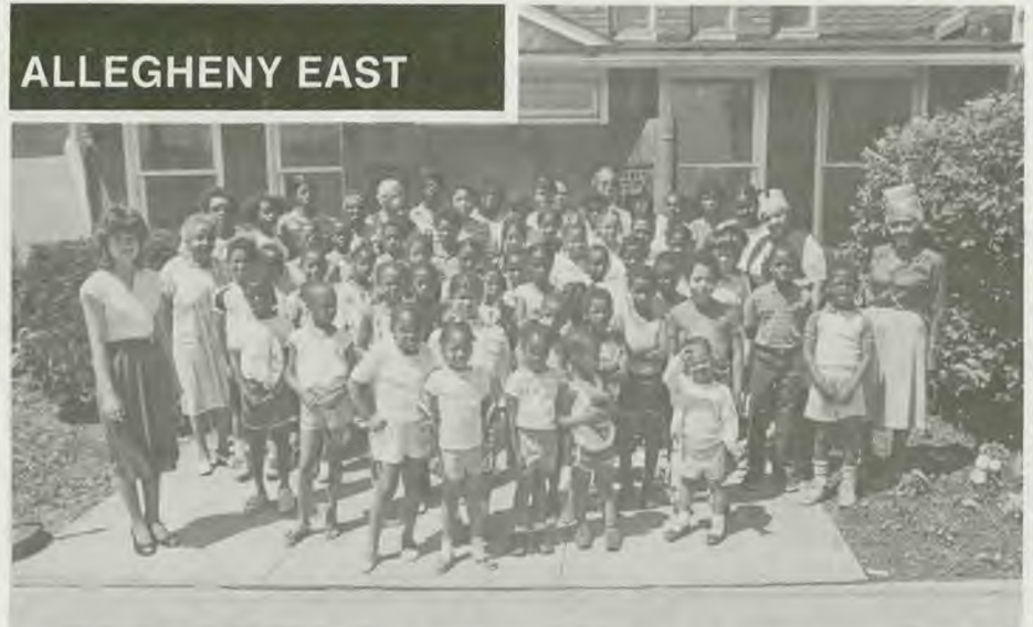
The Coatesville, Pennsylvania First SDA Church VBS had 92 students. Shown above are a portion of the group and staff.