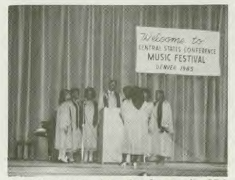
A musical group from the Community SDA Church, Denver, Colorado performed at the Festival

The evening program was full of activity with the Central States Conference basketball/volleyball tournament, which was held at the George Washington High School in Denver. Throughout the tournament series, the winners were Linwood Temple of Kansas City, Missouri for basketball and Park Hill in Denver for volleyball.