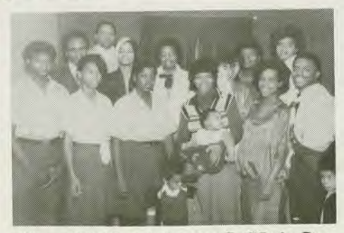
Killeen SDA Church observes Pathfinder Day