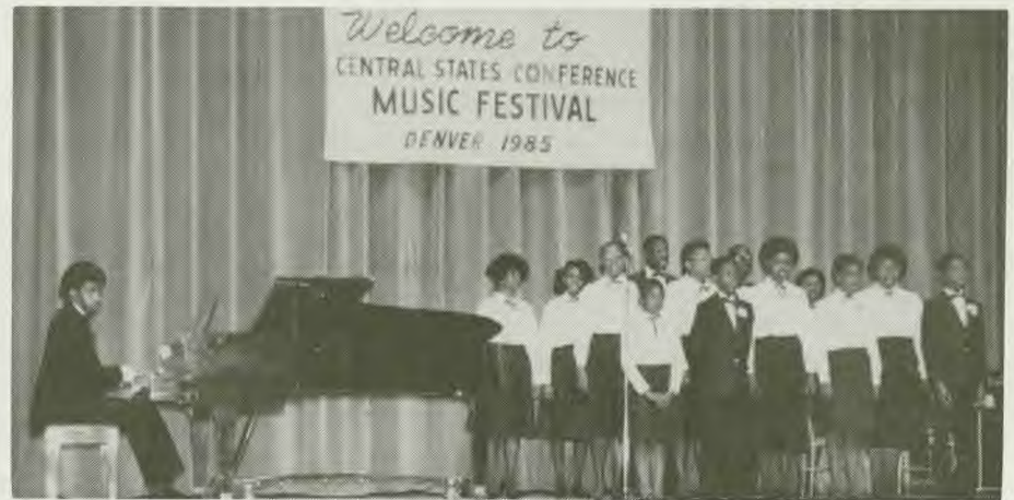
A Youth Group from the College Avenue SDA Church, Topeka, Kansas sang during the Music Festival.