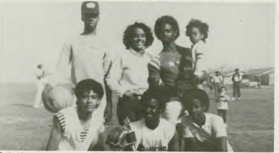
Cedar Grove participated in all field events and won trophies.