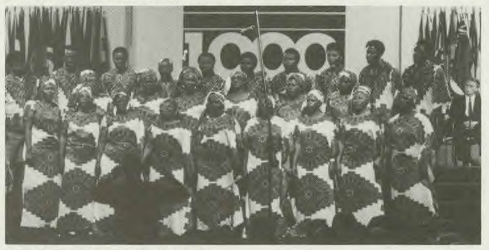
South African Choir from Bethel College.

The parade participants were from all over the world: Cuba, Africa, Eastern Europe, U.S.S.R., Lebanon, Syria, Nicaragua, Tennessee, China, in all there were 2,000 participants marching under the banner of 184 flags.