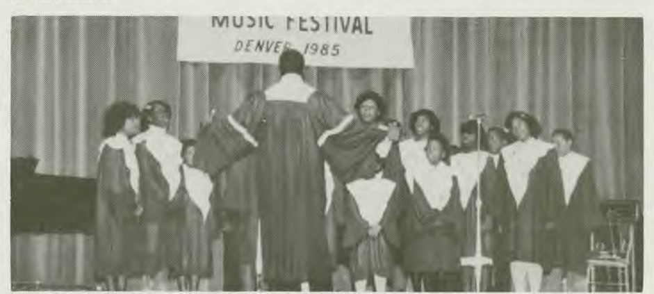
A musical ensemble from the Bethel Church, Kansas City, Kansas sang during the Festival.