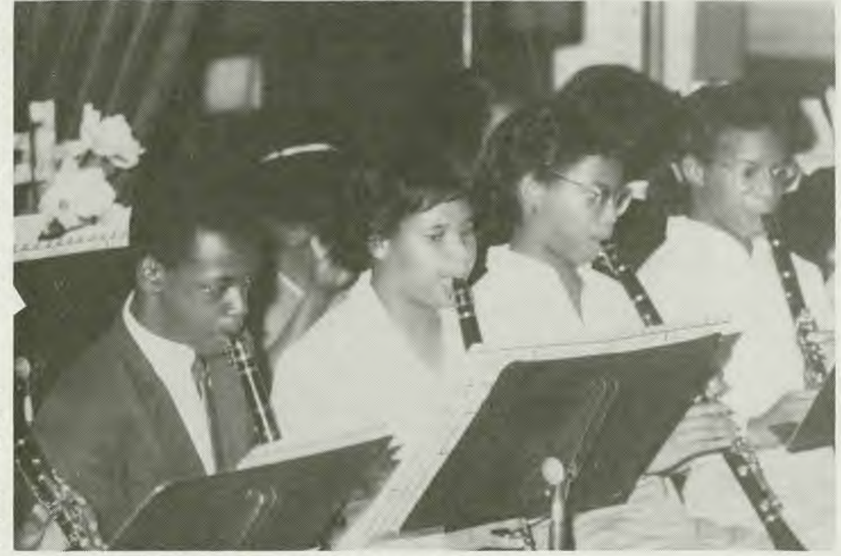
Grades 5-8 giving a band selection during the program.