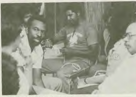
Reporter Pathfinder Staff Training Seminar