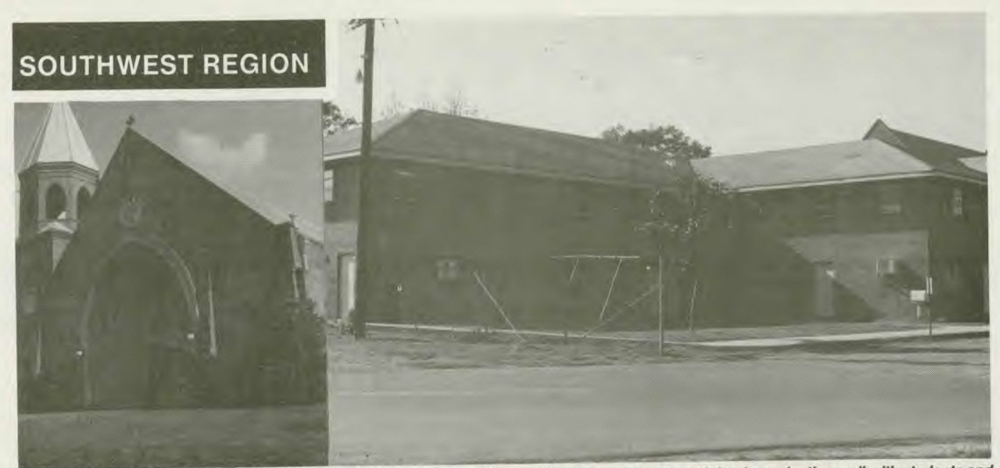
We marvel at the fact that the Philadelphia School has been in operation for 66 years, and has served the denomination well with students and teachers. (Pictured the new edifice and school)