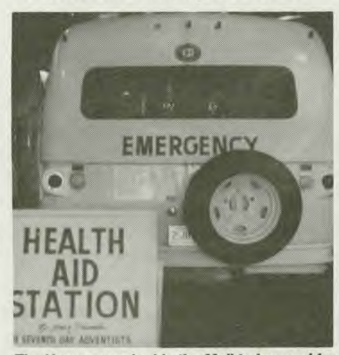
The Van was parked in the Mall to be used for blood pressure screening and other health related examination.