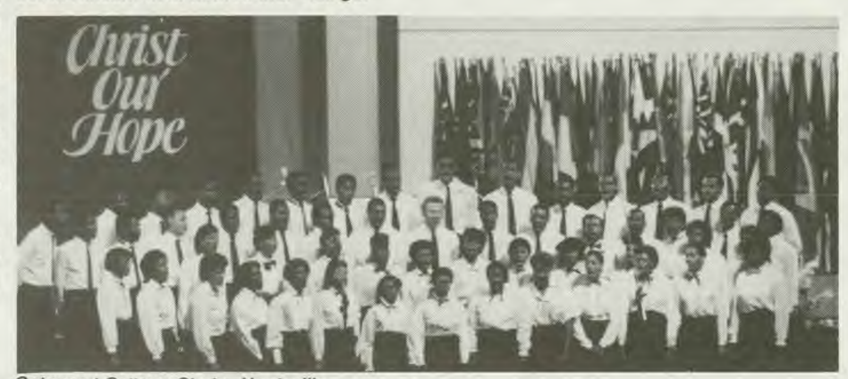
Oakwood College Choir - Huntsville.

displayed at the French Market in the Hyatt Regency Hotel. This art exhibit was coordinated by Greg Constantine and featured approximately 70 artists from 24 countries.