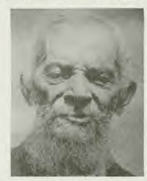
C.M. Kinney, first Black adventist minister ordained (1889).