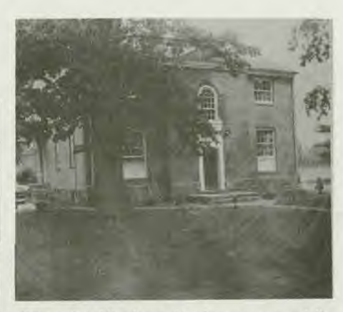
When the Allegheny Conference moved its headquarters from its first office on Irving Street in Northeast Washington, it built this office at Pine Forge.

The new conference opened an office at 1218 Irving Street in Northwest Washington, D.C. This location soon changed, however, when on September 25, 1945, the Allegheny Conference Committee voted to establish a boarding academy for the youth of the conference. On December 12, 1945, the Conference Committee voted to purchase land at Pine Forge, Pennsylvania for the erection of the academy.