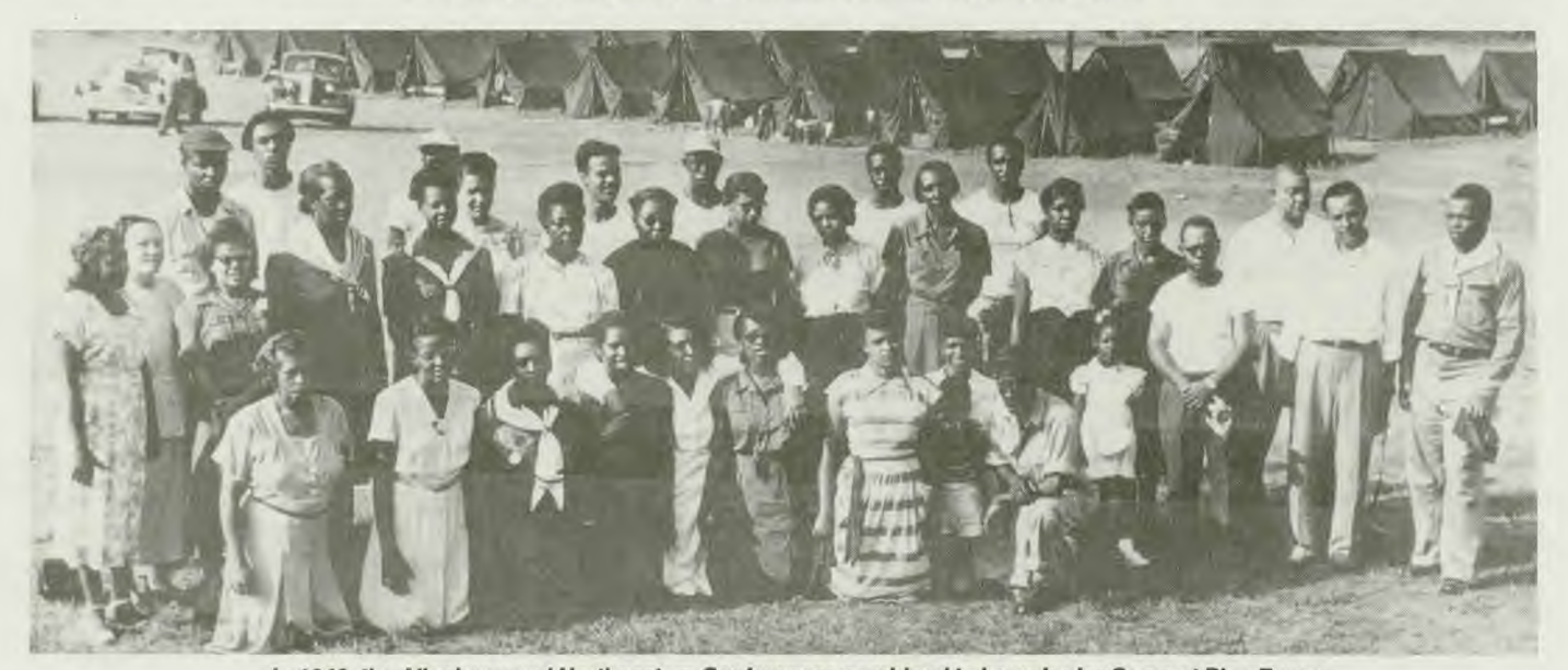
In 1949, the Allegheny and Northeastern Conferences combined to have Junior Camp at Pine Forge. Pictured are the counselors who served that summer.