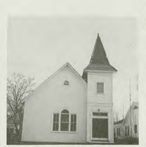
Oldest Church - Yazoo City, Mississippi.

James Edson White, son of Ellen G. White, made a 72-foot steam boat, the Morning Star, to evangelize the blacks along the Mississippi River 1894-1905. As a result, some 16 churches were organized in Mississippi.