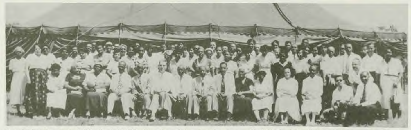
An early Literature Evangelist Meeting held at Pine Forge brought together a large group of individuals whose efforts and influence helped to make Allegheny and Allegheny East Conference, a leader in literature sales.