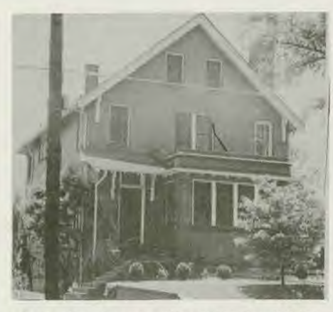
The first conference office of the South Atlantic Conference.