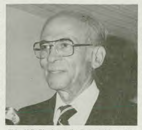
Elder H.D. Singleton, the first president of the South Atlantic Conference.