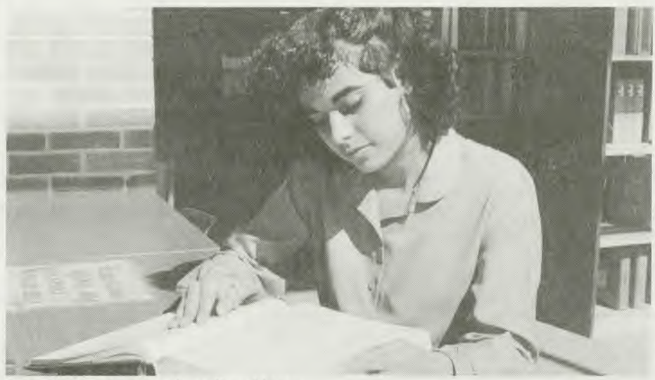
A student studying in the college library.

tion on the good thing about bad times or on the opportunity of adversity.