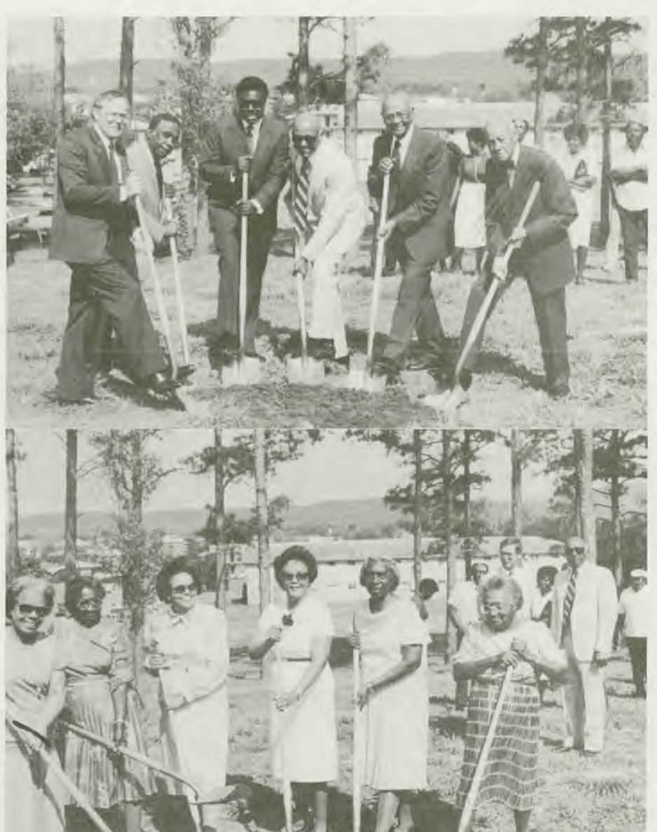
Huntsville Adventist Apartments ground breaking 76 senior citizens.

On Sunday, April 27, 1986, the First Church of Huntsville, Alabama held a groundbreaking service for a 76 unit apartment complex for senior citizens and handicapped persons. The church had been working on the project for nearly three years, with the sponsorship of the South Central Conference. It is the sixth housing project sponsored by the South Central Conference, but the first to be managed by a local church.