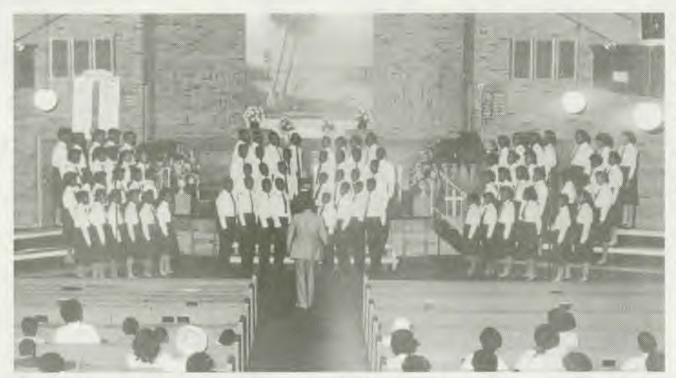
Ribault Junior High School Chorus rendering a concert at Ephesus S.D.A. church, Jacksonville, Florida for the closing of the 16th church anniversary program, April 26, 1986, 6 p.m. in the church auditorium.