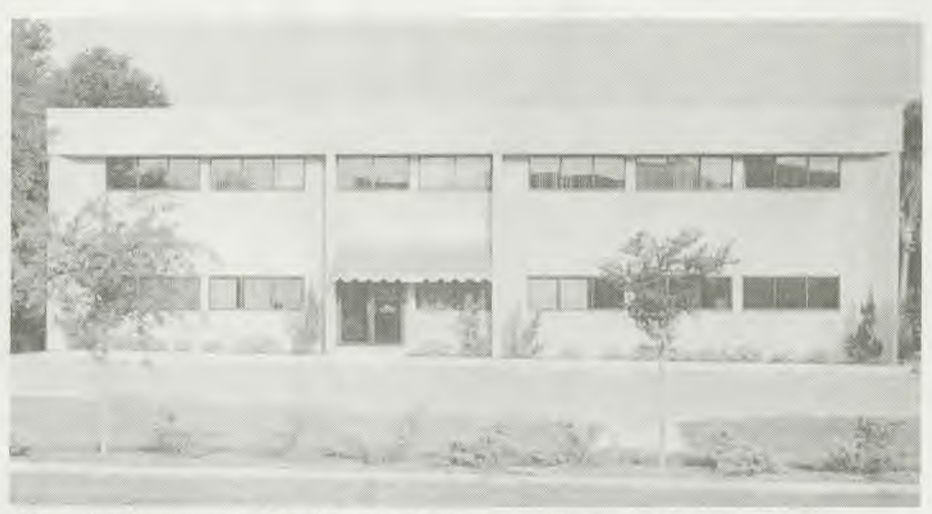
Home headquarters for Southeastern Conference, Altamonte Springs, Florida.

After three months, on May 18, 1986 the doors were finally thrown open for service to the constituency and the public. Scores of individuals came to witness the memorable occasion and to rejoice in what God had accomplished.