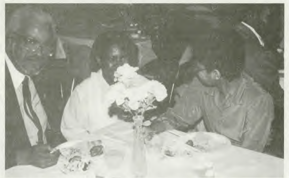
Literature evangelists hold a banquet at Oakwood.