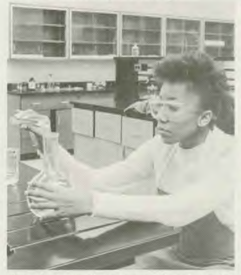
A student experimenting in the science lab.

The Business and Information Systems department is being recognized as one of the best in the denomination and in the state of Alabama. This department packs an impressive arsenal of business tools in its model office laboratory to give hands—on experience. There are: 20 Xerox microcomputers, a Xerox dedicated word processor, and an Ethernet Communications System; and a multi–purpose laboratory equipped with 40 IBM microcomputers, 10 buffers and printers, and an electrahome system—all dedicated to making Oakwood graduates the head and not the tail of the complex world they are facing.