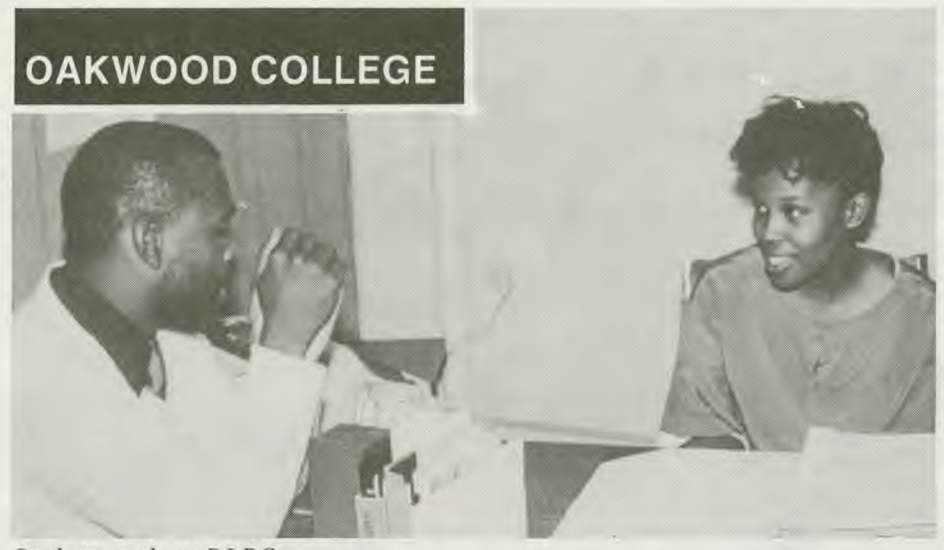
Students study at DLRC.