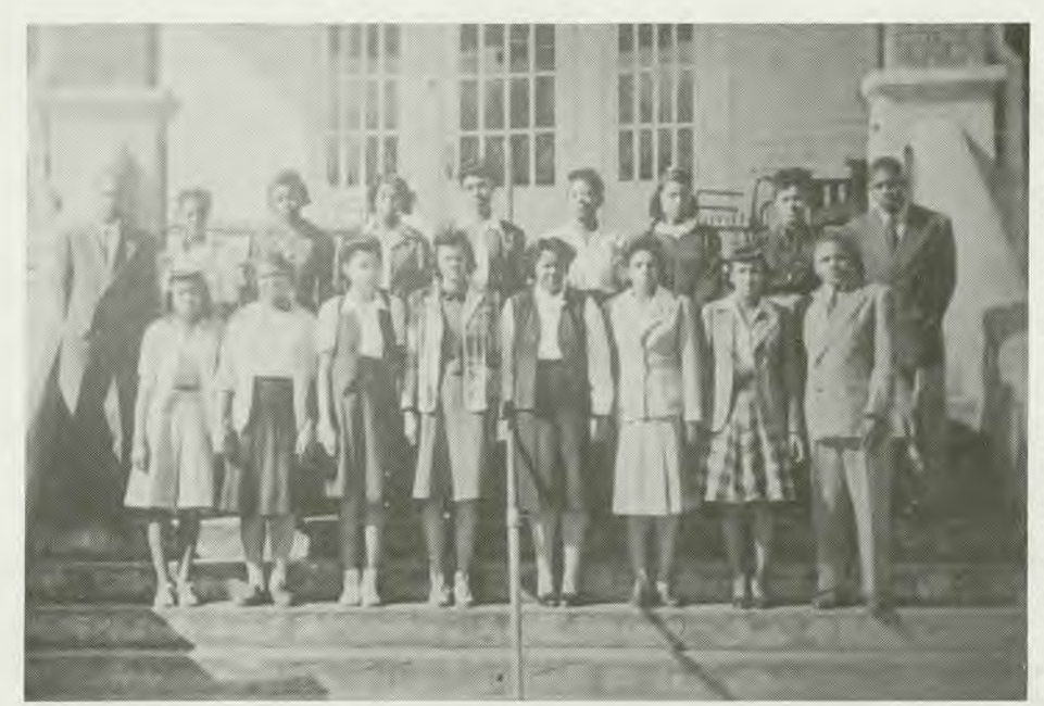
Class of '47.