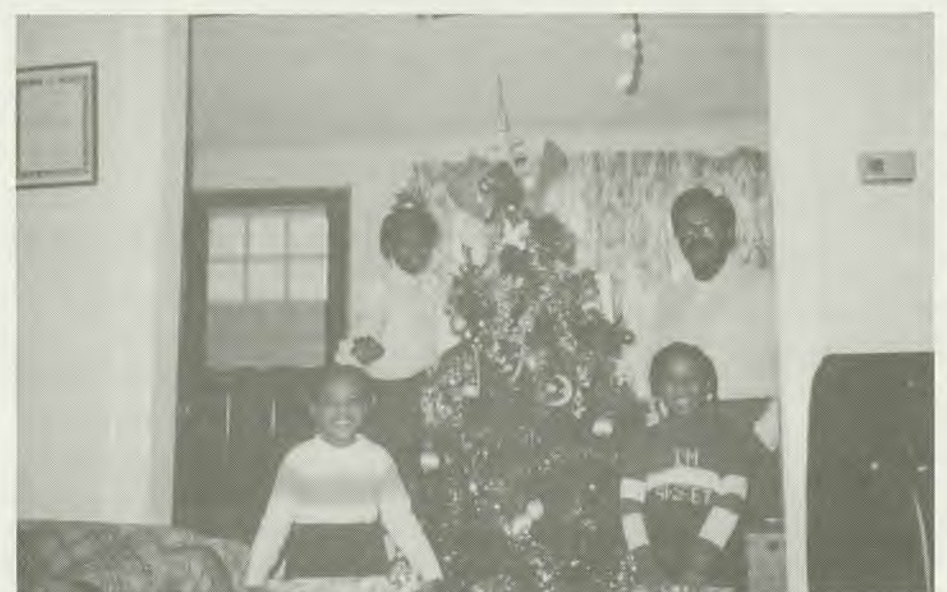
The Slater Family.