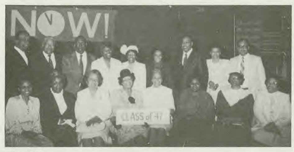
Class of '47.