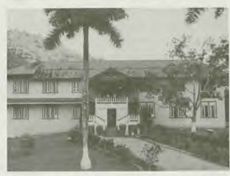
Women's dorm—Austin Hall, Caribbean Union College.