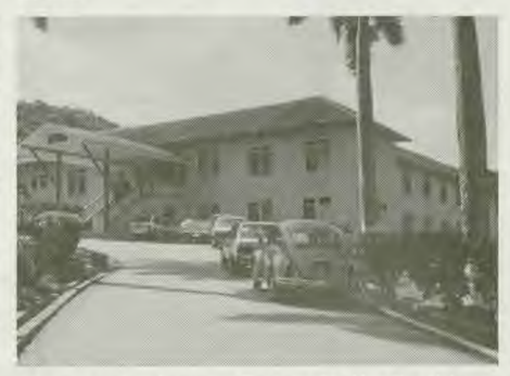
The men's dorm—Cedar Hall, Caribbean Union College.

My activities were many and varied. There was never a dull moment. In addition to serving as pastor of the College church, I taught a class in Christian Beliefs, conducted numerous Week of Prayer at the College, the academies, primary school and in the different churches. Literature Evangelists institutes, church officers meeting, laymen's rallies, yoth meetings, counseling sessions and tutoring were areas of personal involvement."