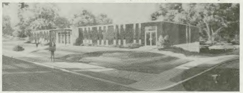
Central States Conference Office Building, 1968.

The second building, the seminar building, can be reached via an underground tunnel linked to the chapel. This building will be used for the cafeteria and dormitory rooms for year round housing.