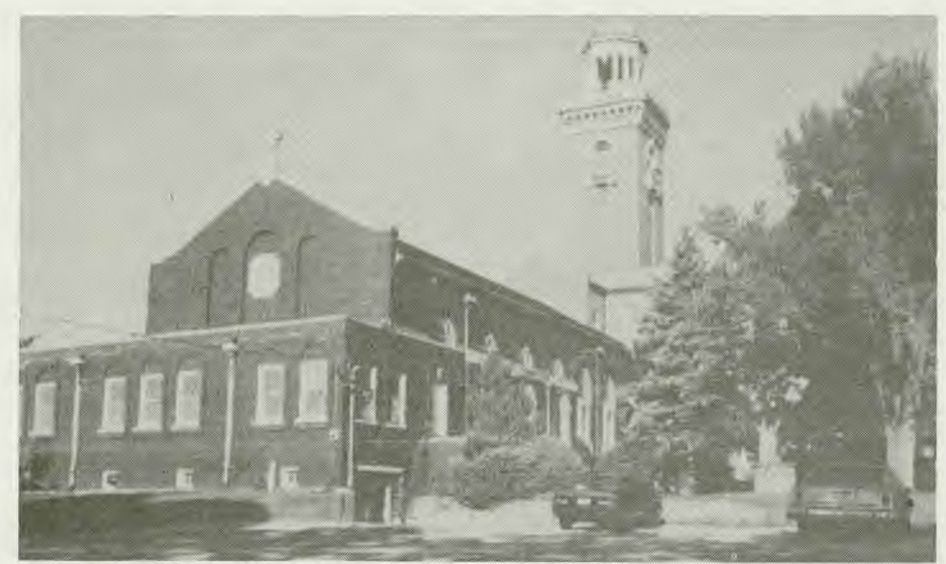
Central States Complex-Instructional and Activity Center.