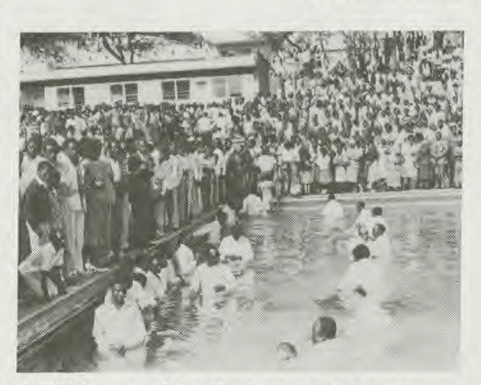
1,200 baptized by Rock in Nairobi, Kenya.