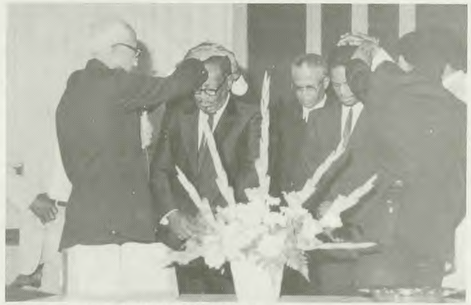
Ordination service at the Park Hill SDA Church.