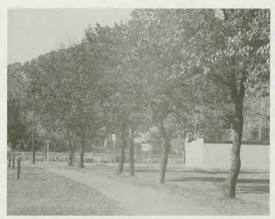
We are thankful to God for the beauties of nature.

that spawned their celebration, the gratitude expressed by these pilgrims was limited in scope and short-lived. They were thankful enough to prepare a feast, but not enough to accept as neighbors and fellow-residents those whose race and religious persuasion differed from theirs. They were thankful enough to throw a big celebration, but not enough to treat Indians and Blacks as equals, as they desired to be treated.