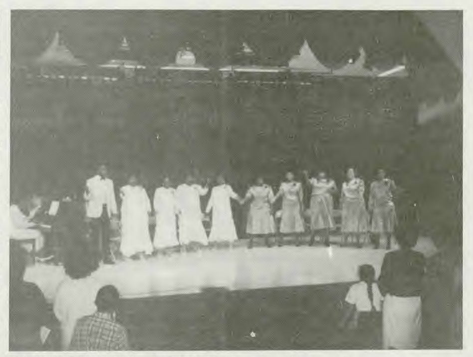
The SOUNDS OF JOY and SISTERS perform a number together.

The SISTERS performed a cappella, except for the Invitation to Discipleship, which was a group effort. All pastors present were invited to the front as the appeal was made.