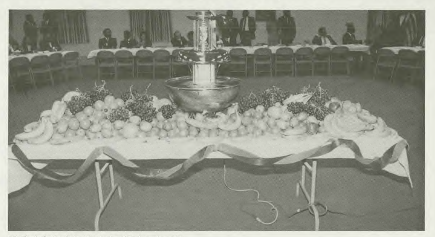
We thank the Lord for daily food and the bounties of life.

Evidently the first settlers were thankful for something, hence the celebration. But, in retrospect, one wonders, thankful to whom, and for what? Was it thankfulness for survival, for food or for friendly relations with the native Indians? Whatever it was