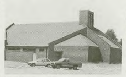
New Covenant Church, Memphis, Tenn.

As the work grew and new congregations were established in the west Tennessee community, only buildings that had been used by other congregations were secured for their services. When