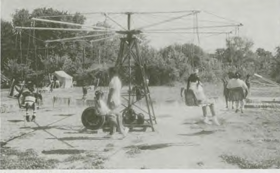
Students enjoy "swinging in space."