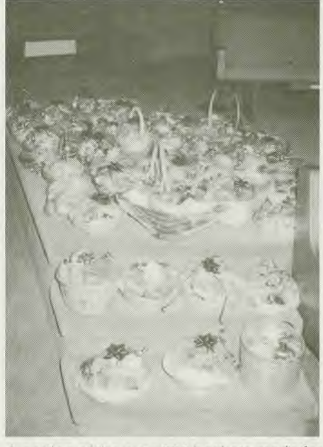
A portion of the over 200 baskets made for the Camden, N.J., Police Force.