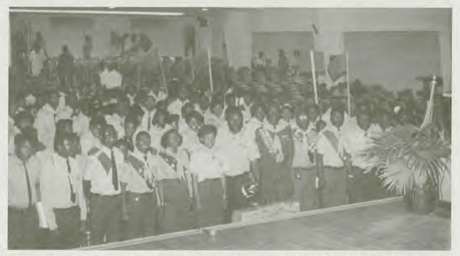
Pathfinders being invested representing the French sector of the work in Southeastern Conference.