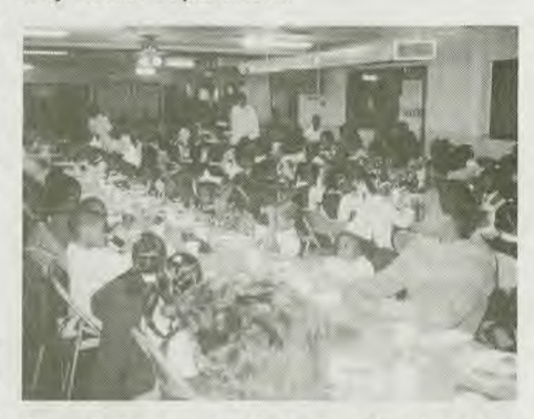
Alcy students enjoy their own Thanksgiving dinner at school.

Thus far, this form of outreach has been effective. The church is presently planning a medical day program which will involve the city health department.