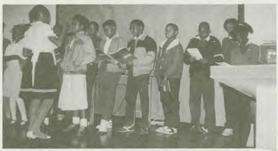
Fifth and sixth graders sing one of the early Adventist hymns during the Home and School program.

If you ever are blessed to visit the First Church in Huntsville, Ala., on Sabbath at the time of the 11 o'clock services, the memories will ever linger in your mind and on your heart.