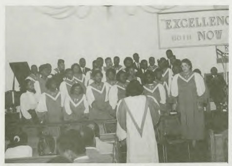
The Christian Fellowship renders special music during the Divine Worship hour.

The day's activities were planned under sacrificial devotion to our children's future."