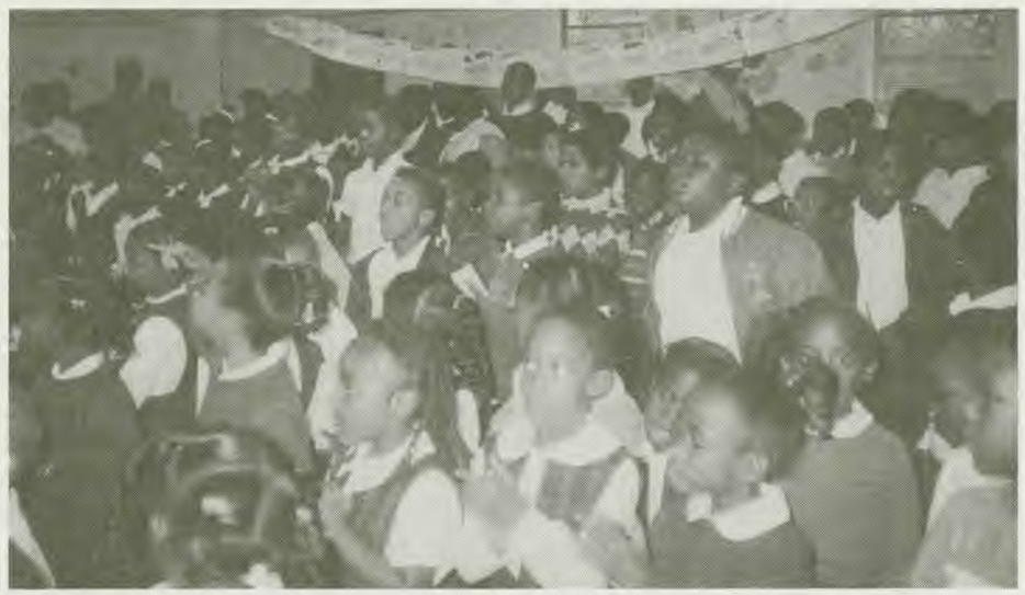
Alcy students during morning devotion.