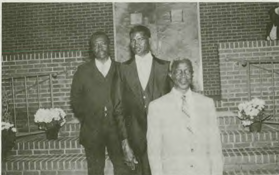
Laity for Daphne, Alabama, who built the building