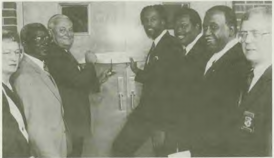
Ribbon cutting at Daphne, Alabama.