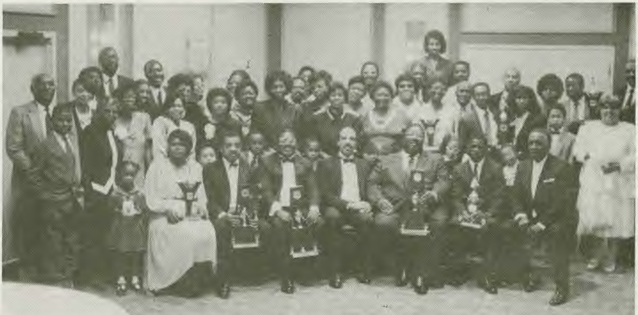
Literature evangelists from the South Central Conference—1989 deliveries: $315,600.00