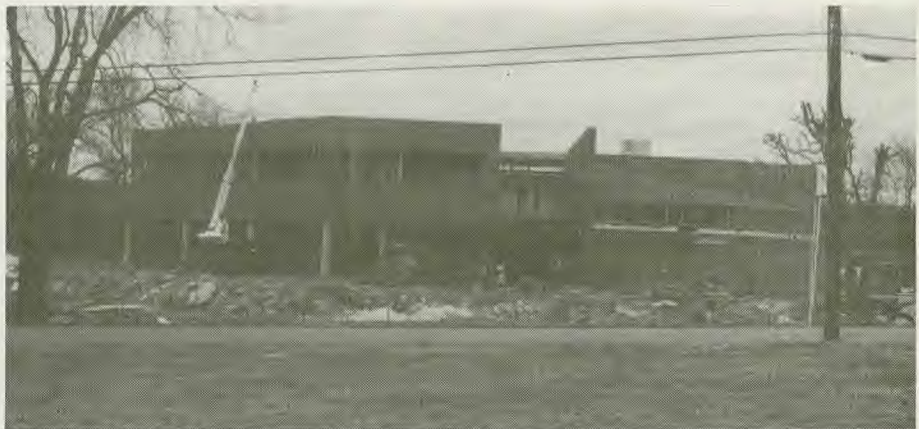
South Central Conference office building nears completion.