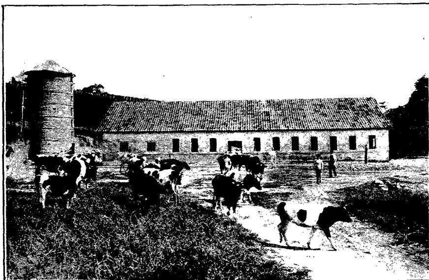
Young Herd of Holstein Cattle at the Brazil Training School

Reputation is what men and women say of us. Character is what God and the angels know of us.