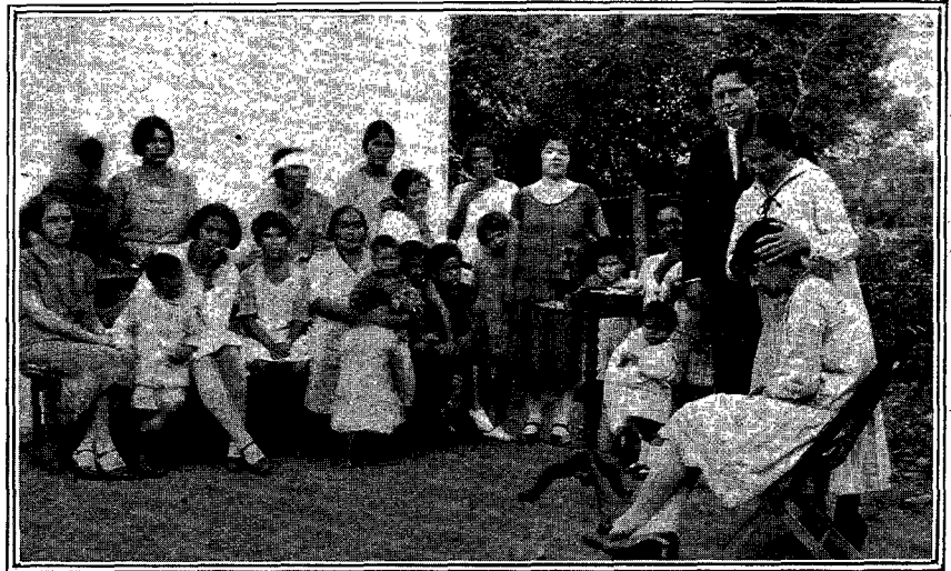
Medical Missionary Work in Asunción, Paraguay.