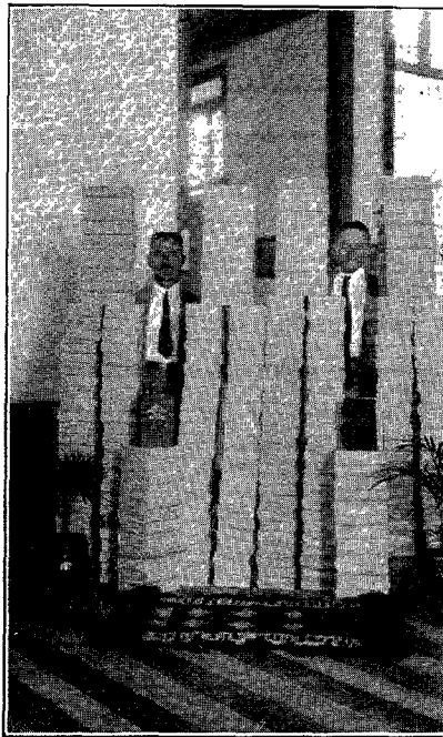
Pioneer Colporteurs in the new Lower Amazon Mission