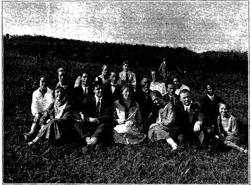
Summer School held in Santo Amaro, Brazil.

Field Missionary Secretary, Rio Grande do Sul Conference.