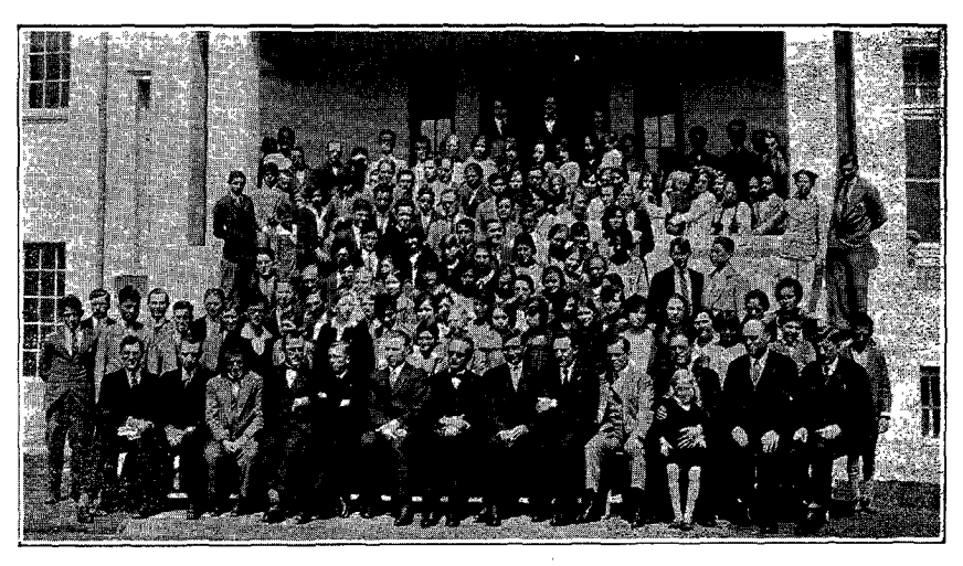
Brazil's first Missionary Volunteer Congress.

THE third angel's message is moving forward with great rapidity in the earth, and urgent demands for men and means are coming from every land. We are in the last days, and the Lord will soon finish His work. New fields are being opened before us, which call for more workers and means. Thus it is an ever expanding work with which we are connected. Nor would we want it otherwise, for we long to see the work