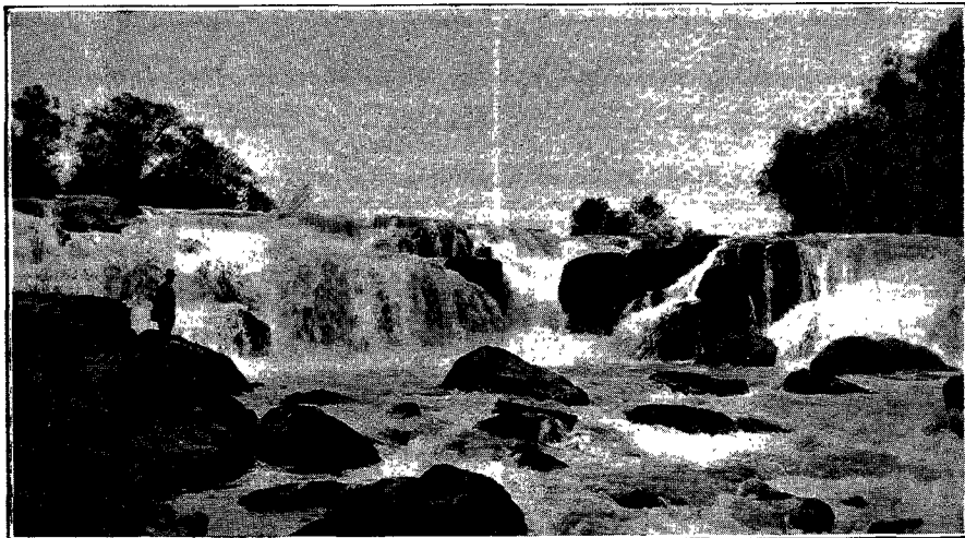
Waterfalls in South Brazil near which a number of souls have been baptized.