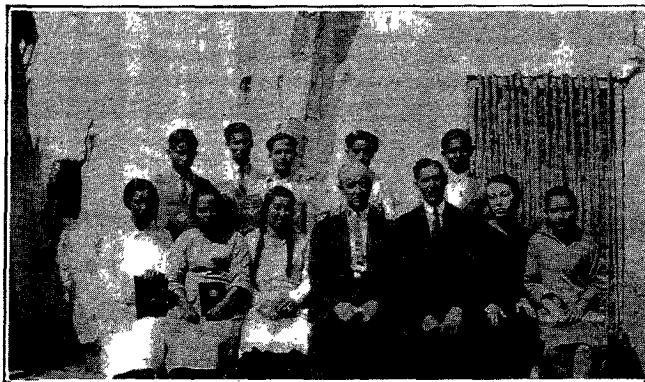
Group of believers at Chepen, Ecuador.

Again it was reported among the Indians that we were going to bring a plague of crocodiles to destroy all of them. Then when we had gained their confidence again, two fine young couples came to stay with us. But they say some unkind words by a man who at the time was working here discouraged them and they left. Now one of these young men and one of the young women are dead. Then when a number of families were planning to move near us and establish farms, the enemy caused it to be talked that the mission was going to