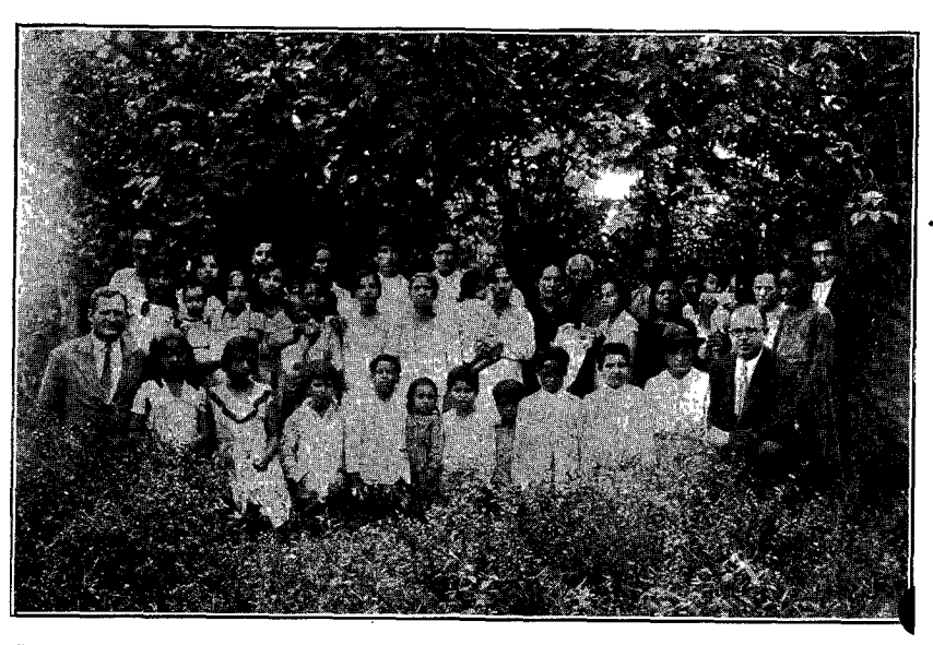
Group of believers at Sabanettas, Ecuador, won to the truth by the efforts of a lay member.

Recently the mission headquarters were moved from Colta to Riobamba, as that place is more centrally located and makes a splendid center for our work in Ecuador. Already there are some interested ones studying the truth in this place. It is expected that soon we will also have a little church there. A splen-