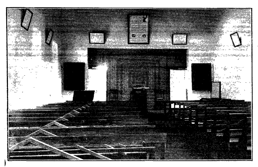
Interior of the new church building in Chepen, Peru.