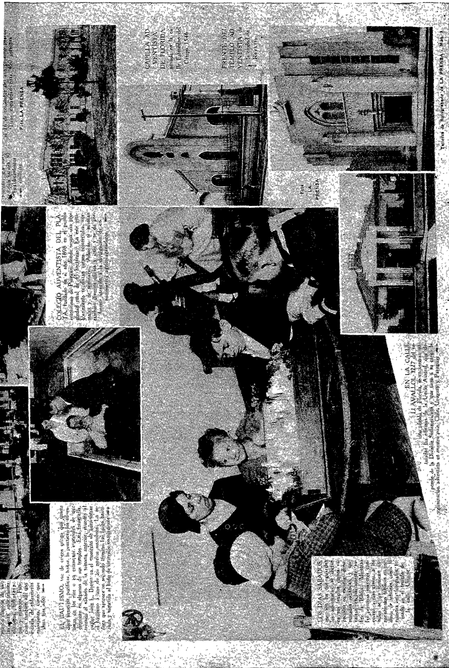
COLECCION ADVENTISTA DEL PLAN... Escuela de Puiggari, donde se da un curso de educacion para las niñas de la ciudad de Buenos Aires. En este momento se dicta un curso de ortografia y aritmetica. Los alumnos son de la escuela de la ciudad de Buenos Aires.

The first few lines of the description of our work, reads as follows; The members of the Seventh-day Adventist Organization, . . . celebrate their Sabbath on Saturday, and believe in the nearness, without fixing a date, of a better era, which will begin with the return of Christ to the earth. They are also in principle vegetarians; practicing abstinence from alcohol, tobacco, as well as tea, coffee and other stimulating drinks, and if they find some sports acceptable and commendable, they decidedly oppose others that are characterized by their violence, such as football, boxing, etc. Those who compose this organization, have for many years done an intensive work, to bring people into their church, which has especially developed in the Federal Capital, in the neighboring town of Florida, in the department of Diamante, in the city of Rosario and in other centers and towns of importance. They now have many temples and churches, in which are carried out systematically, preaching services and other ceremonies in relation with the religion which they profess.