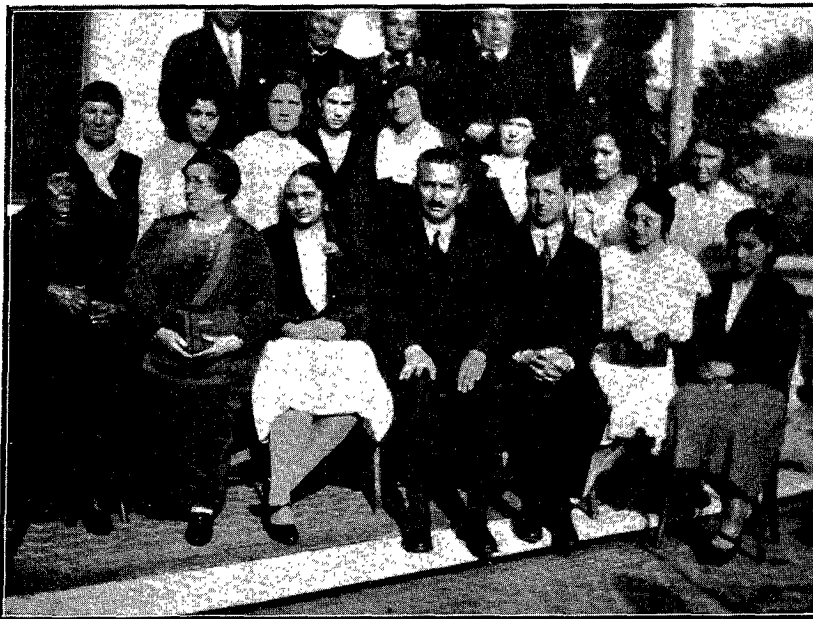
Group of persons recently baptized after the effort in Junin, together with the workers.

"Commit thy ways unto the Lord; trust also in Him, and He shall bring it to pass." Ps. 37: 5.