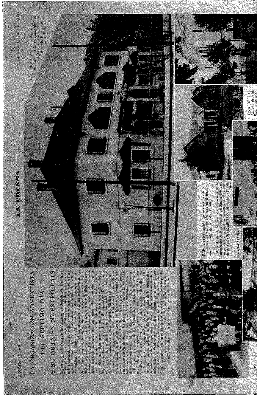
One of the pages of the pictorial section of a recent Sunday edition of "La Prensa" (The Pr Sunday editions of this daily I

thank the Lord for all that has been done and is being done, but believe that much more can yet be accom-