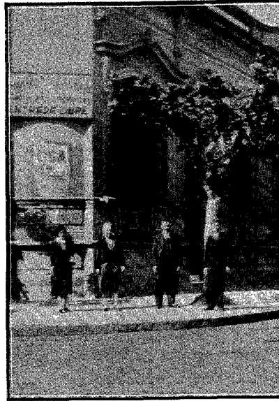
The house in which a public effort was held in the city of Junin, Argentina, and a group of the workers.

The total number of salaried employees in the organized work of the South American Division at the end of the first semester of 1933, was 212; 133 of this total, or 62.8% are products of our training schools of the Division; 73, of 34.4%, are workers imported from other divisions, principally the North American Division. The remaining 6, or 2.8%, are South Americans who have not been privi-