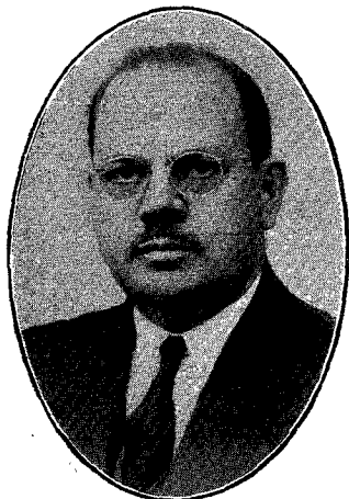
M. V. TUCKER Buenos Aires Publishing House

Special attention is being given to El Atalaya . We are very happy to report that the average monthly circulation of El Atalaya during 1935 amounted to 25,888 copies, the average number of subscriptions sent out from the publishing house during 1935 amounted to 8,898 per month. This periodical is winning souls. Those who take subscriptions to El Atalaya are doing a work of the highest missionary order. Beginning with 1936 a new periodical is being issued for our