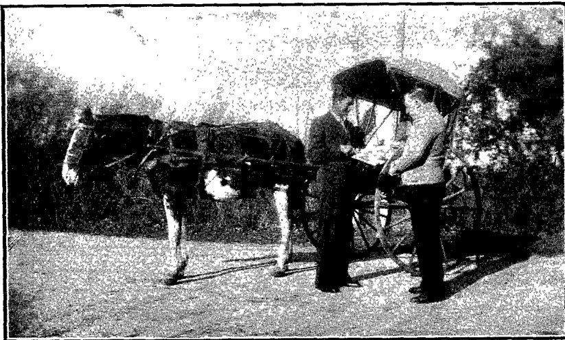
With our colporteurs in Uruguay.

"God has His workmen in every age. The call of the hour is answered by the coming of the man. Thus when the divine voice cries, 'Whom shall I send, and who will go for us?' the response will come, 'Here am I; send me.' Isa. 6: 8. Let all who labor effectually in the canvassing field feel in their hearts that they are doing the work of the Lord in ministering to souls who know not the truth for this time. They are sounding the note of warning in the highways and byways to prepare a people for the great day of the Lord, which is so soon to break upon the world. We have no time to lose. We must encourage this work. Who will go forth now with our publications? The Lord imparts a fitness for the work to every man and woman who will cooperate with divine power.