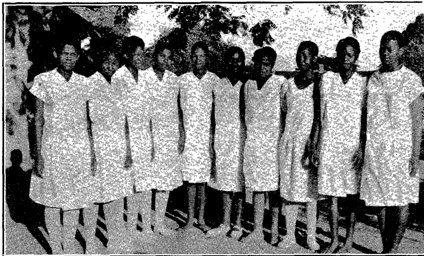
Huishoudkundige Klas, Solusi Sendingstasie.

Die opkoms op hierdie kampvergadering was die grootste van al drie; Sabbat was daar 1,100 mense. Daar het 'n gees van Bybelstudie en van gebed in die vergadering geheers. Sondagmiddag was daar 'n indruk-