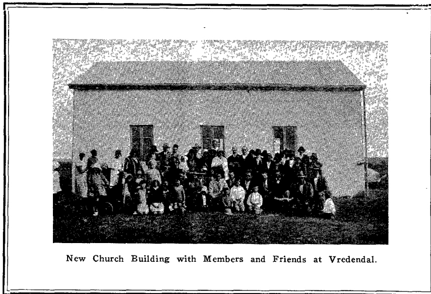
New Church Building with Members and Friends at Vredendal.

"A remarkable feature of the camp-meetings was the very definite response by the many heathen people who had assembled together with the Christians. Over 300 of these people took their stand for the Lord Jesus. This stand was not the result of great urging, nor was it in any way the result of a play upon the emotions. The majority of these were men and women of middle age, who had been called to consider most carefully the truth of salvation by Christ, and realising their lost condition, accepted the Lord Jesus as their Saviour, turning their backs upon their evil ways."