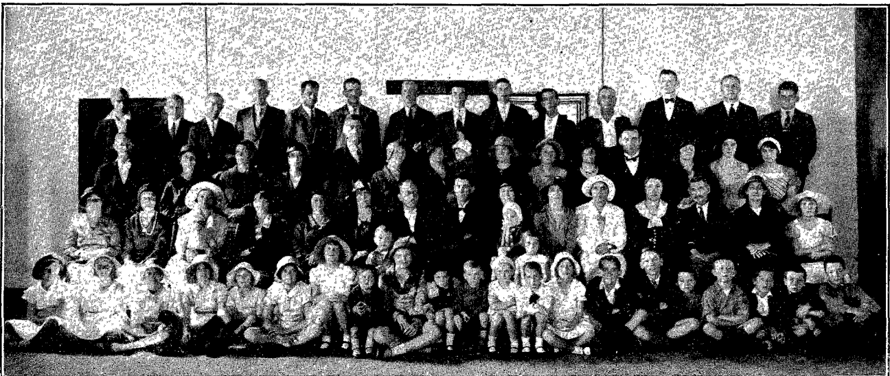
New church at Boksburg North raised up in a laymen's evangelistic effort.