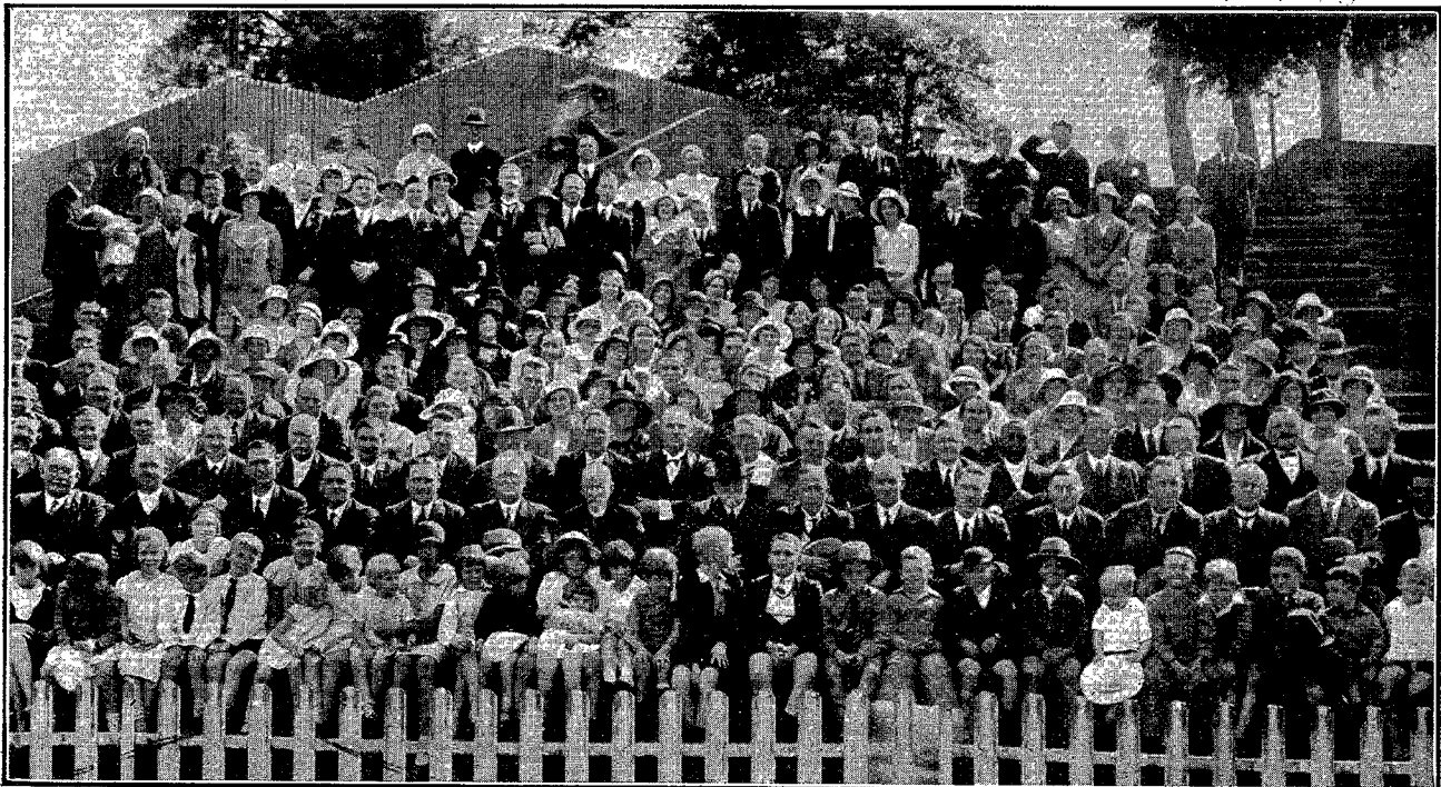
Some of those in attendance at the Johannesburg Camp-meeting.

It is not many years since we started the work in Griqualand East, on the border of Pondoland, at Cancele Mission. We know that as soon as this message is preached at a place, opposition is aroused. We have had this experience in our part of the country, for we were opposed in every advance move we made. We started the work in opposition. There is a text in the Bible which I wish to read to you this afternoon. It is found in 2 Tim. 2:9: "Wherein I suffer trouble as an evil doer even unto bonds. But the Word