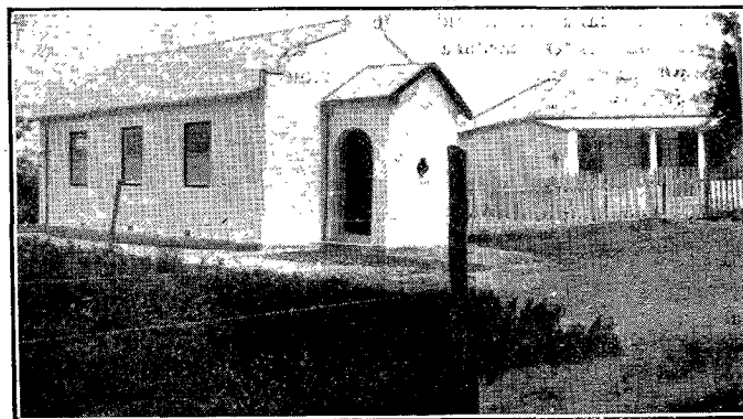
○ ELIM CHURCH, GEORGE ○

Our readers will be pleased to learn that, after the deeds of transfer on the ground were paid, the entire cost of the building, including some very substantial benches and the installation of electricity, was only