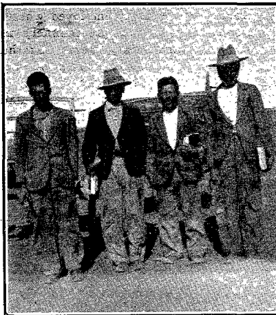
LEADERS OF CALVINIA COMPANY

Step by step the Lord led this man to a knowledge of the Sabbath and baptism, and many other precious truths of the message. There being no minister who would baptise the people, he became convinced that he himself should baptise them. The authorities, undertook, however, not to employ anyone who was baptised or who kept the Sabbath and the leader was also debarred from baptising in the river. He then built a font at the side of his house, and when it was finished knelt down by the side of it and prayed that God would fill it. Rain comes in that country very, very